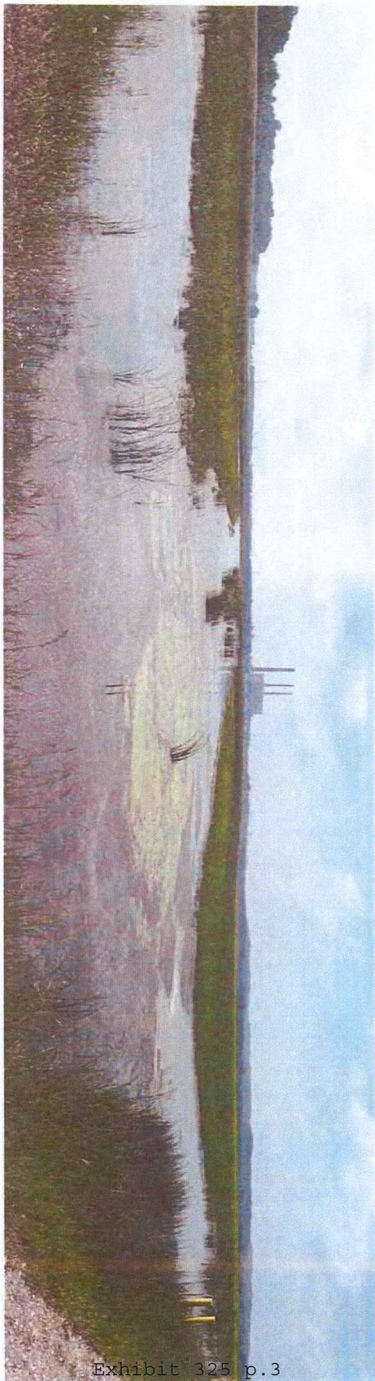
Exhibit 325 p.3