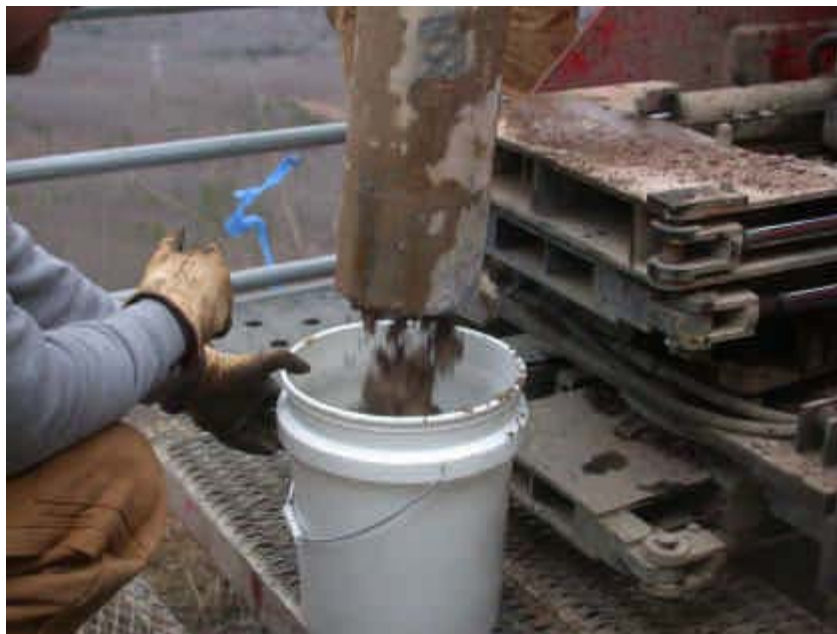
FIGURE 7- 2

SPACE LIMITATION ON THE CREST OF ROCK FILL DIKE