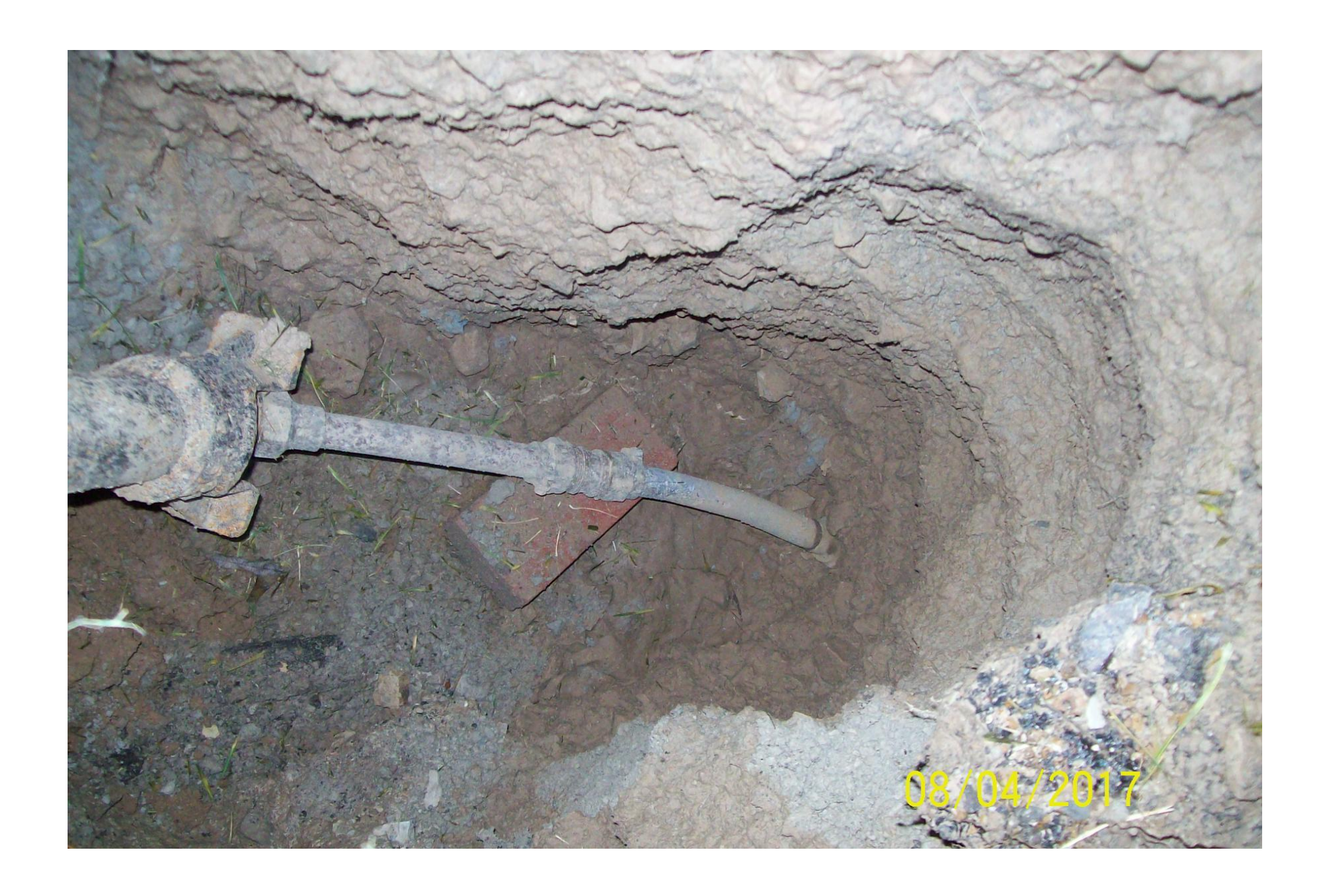
This picture shows a customer's service line that MAWC has exposed during a water main replacement. MAWC exposed the customer's service line to verify if it is lead. On the left is a short piece of copper which is then connected to a lead service line.