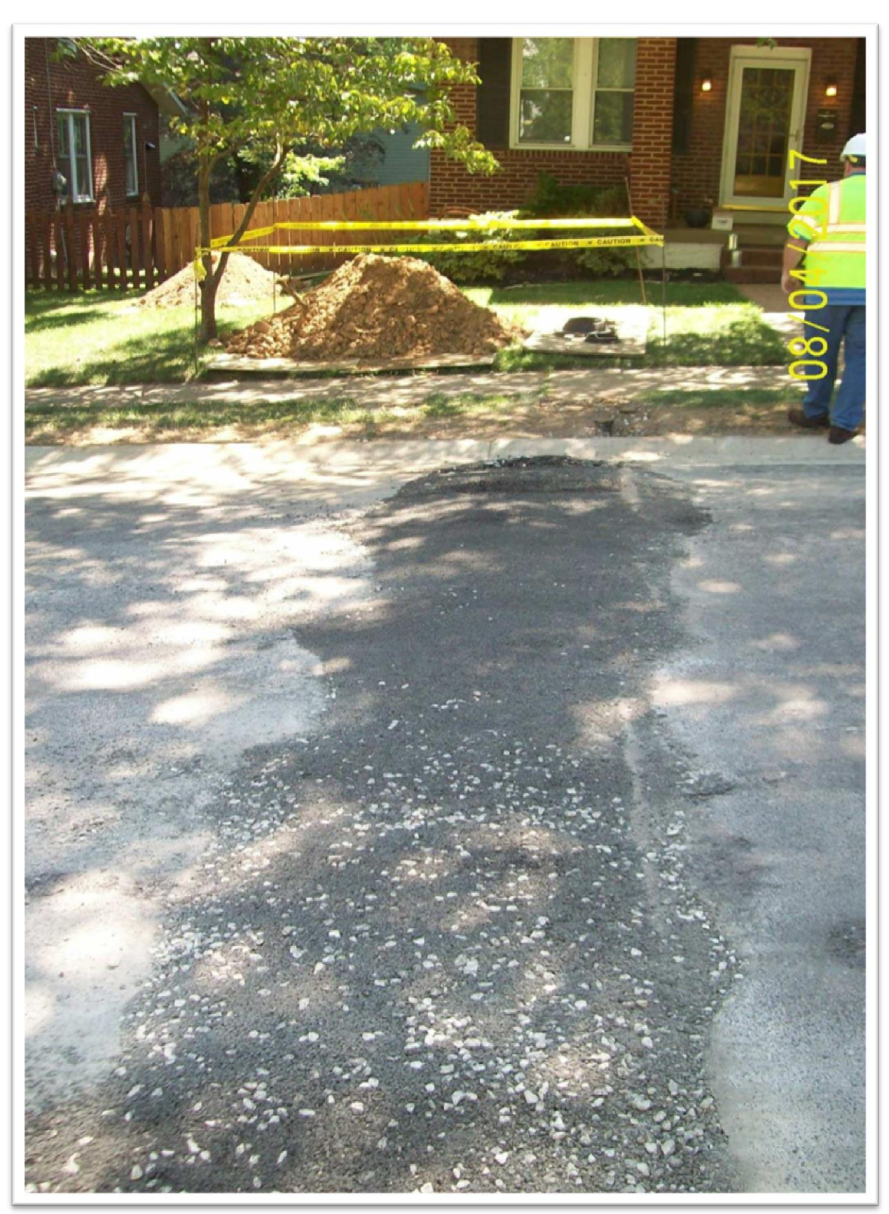
An example of a LSL replacement where the water main is on the opposite side of the street from the customer's home. This photograph is in the St. Louis County service area where the customer owns the entire service line.