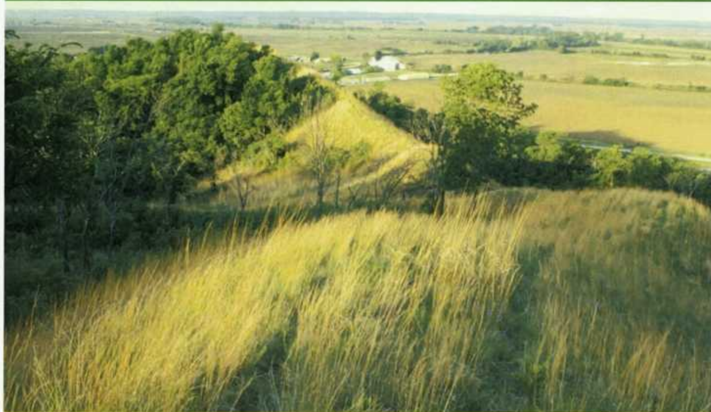
Star School Hill Prairie Natural Area offers a view of Missouri's loess hill prairies.