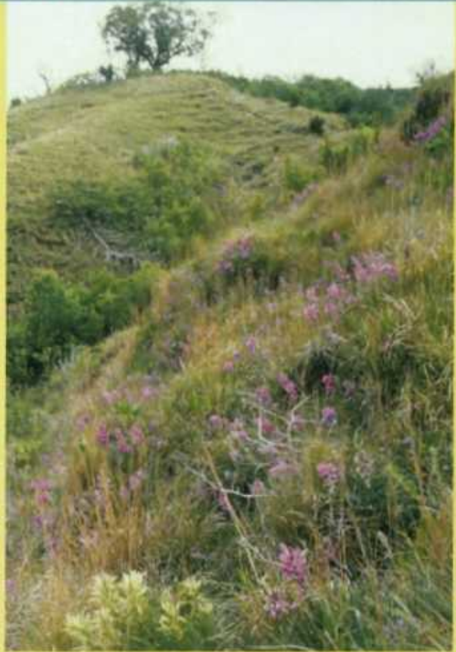
Tim Nagel, Missouri Department of Conservation

Missouri's loess hill prairies are at the southern edge of a chain of loess hills that continue into Iowa.