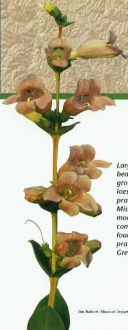
Large beardtongue grows on loess hill prairies in Missouri. It is more commonly found on prairies of the Great Plains.