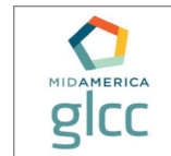
MidAmerica Gay & Lesbian Chamber – MAGLCC