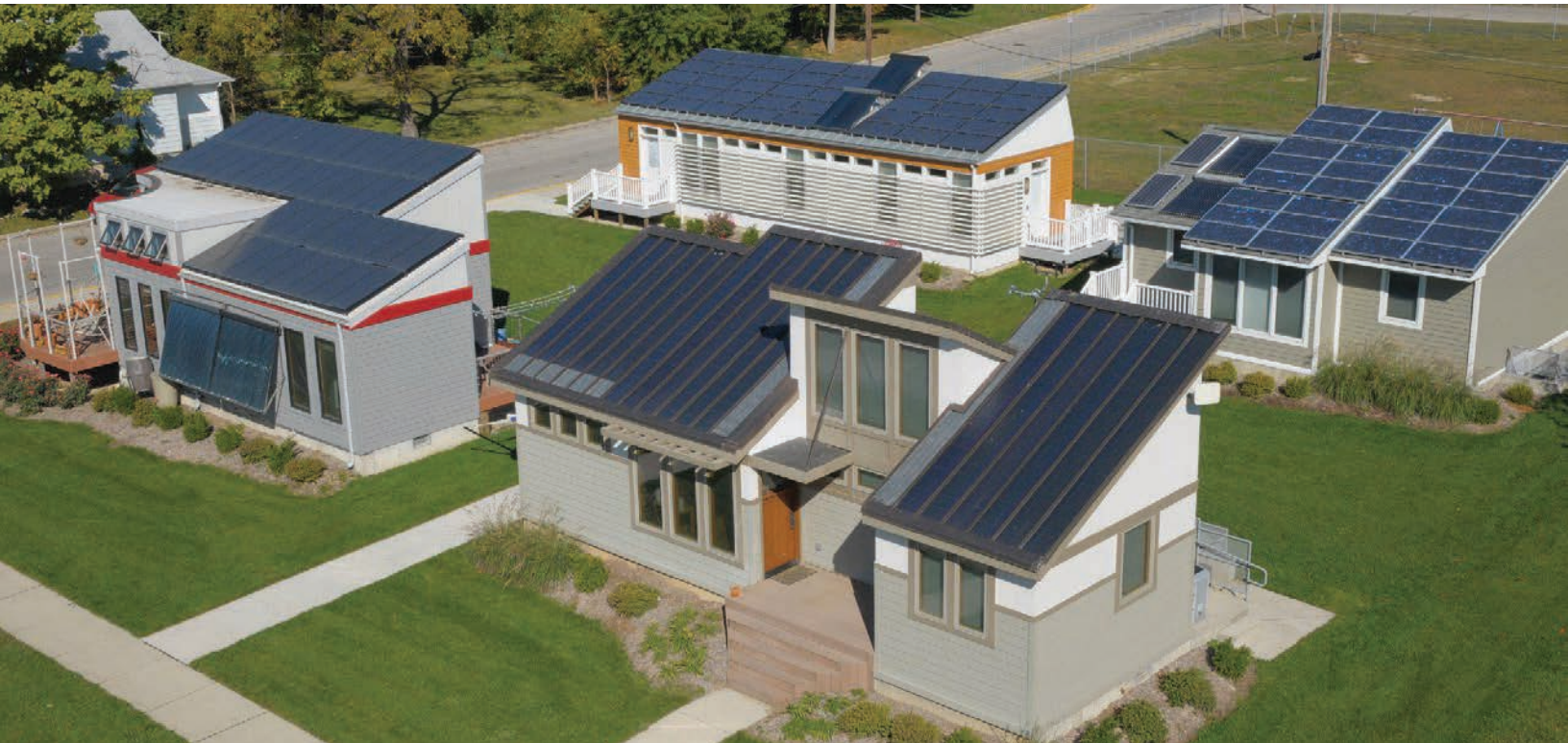
Ameren Missouri is partnering with Missouri University of Science and Technology at the campus' EcoVillage living laboratory.

To ensure we deliver on our customer-first commitment in an affordable manner, we will implement the following strategies: