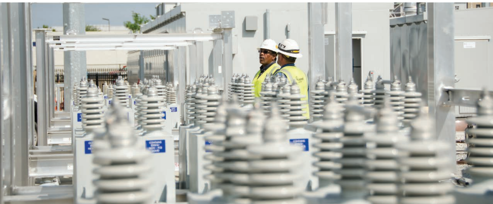
Martin Luther King substation.

more customers through a streamlined network that is more cost-effective and efficient.