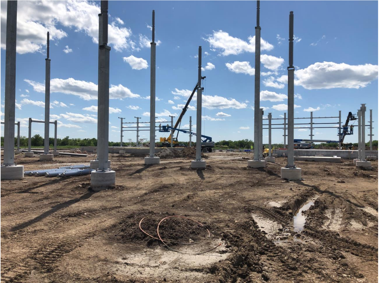
Setting Structures in Substation