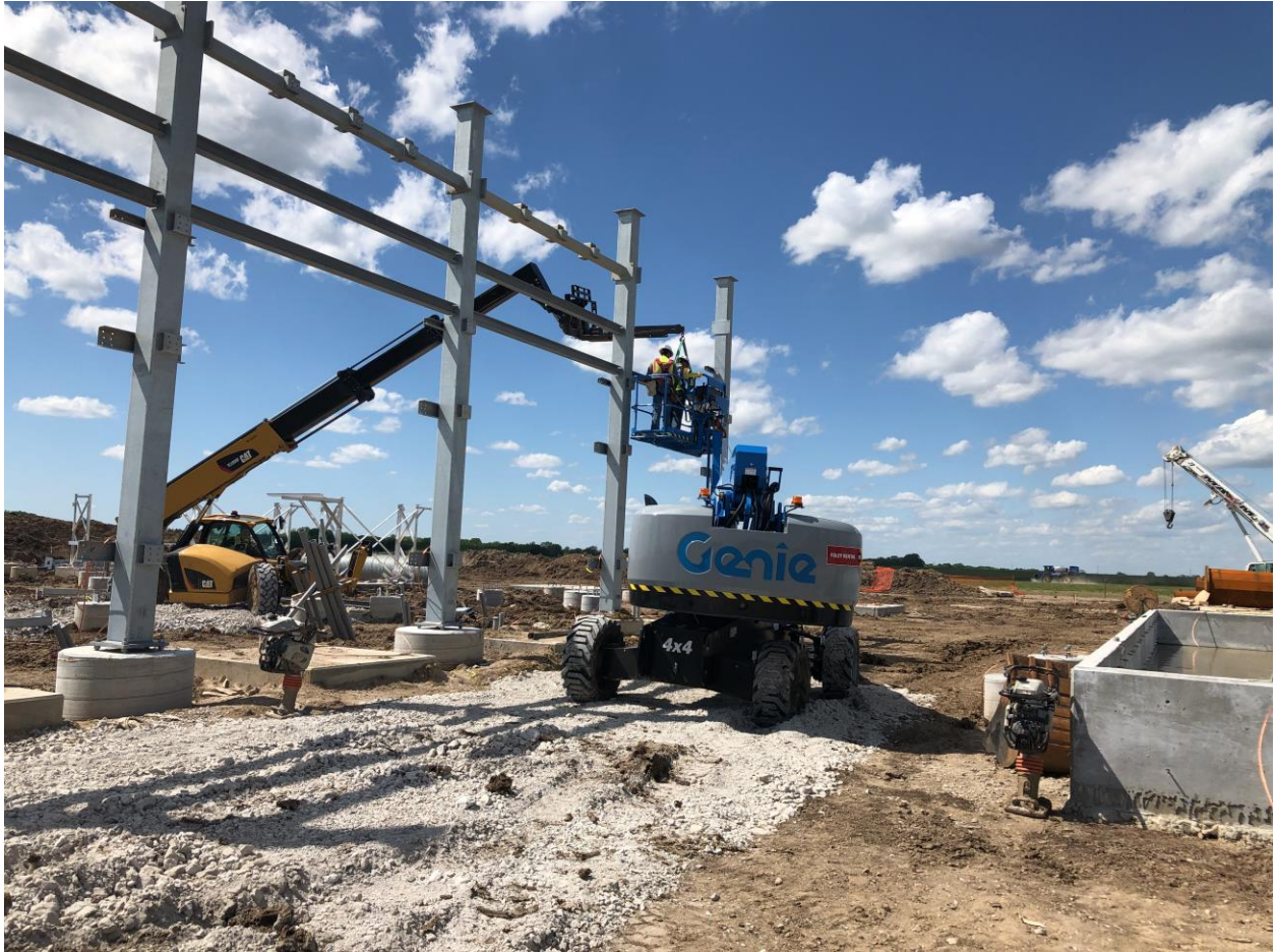
Crew Connecting Cross Beam on Structures in Substation