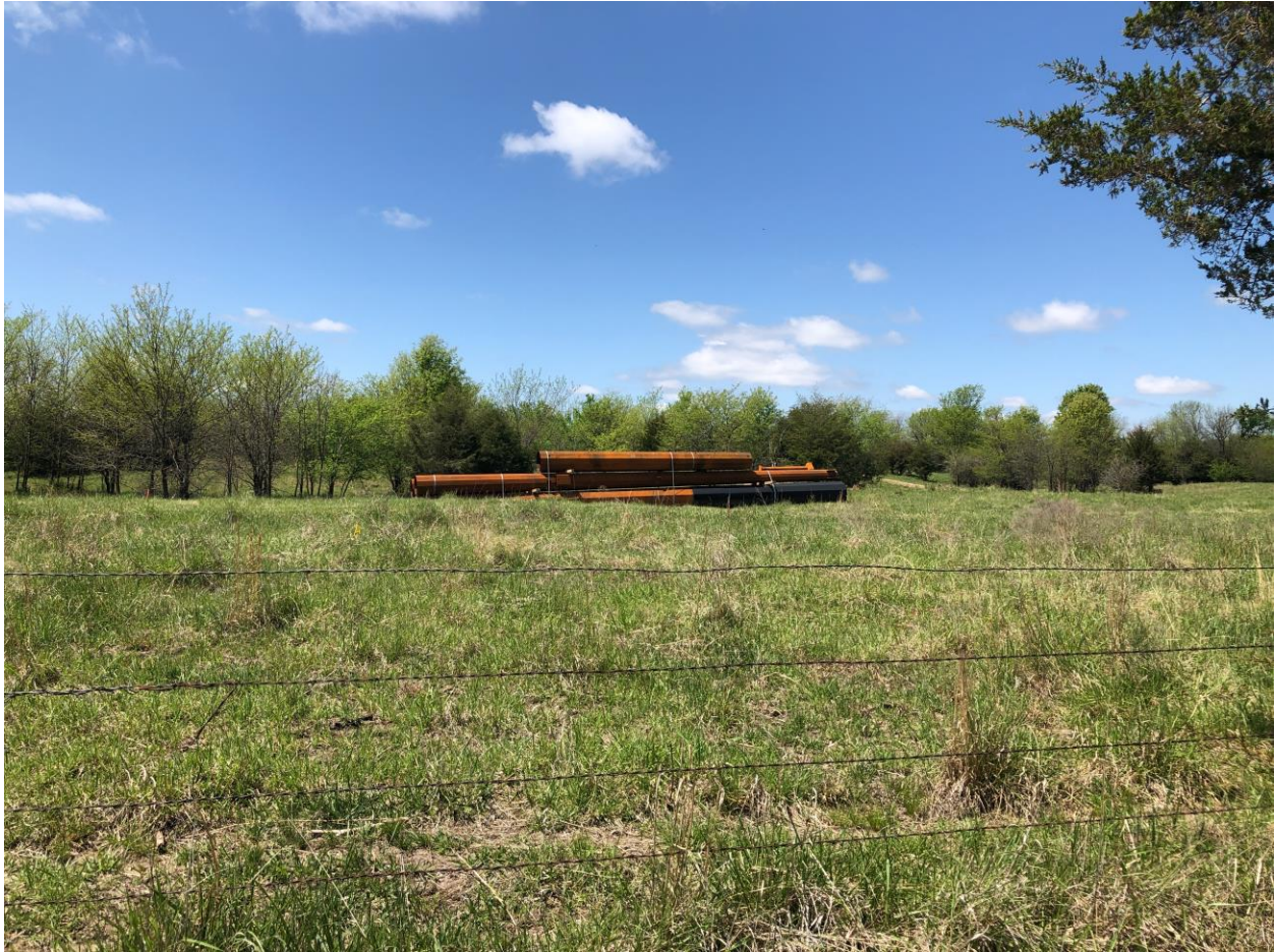
T-Line Structures Being Staged Along Route