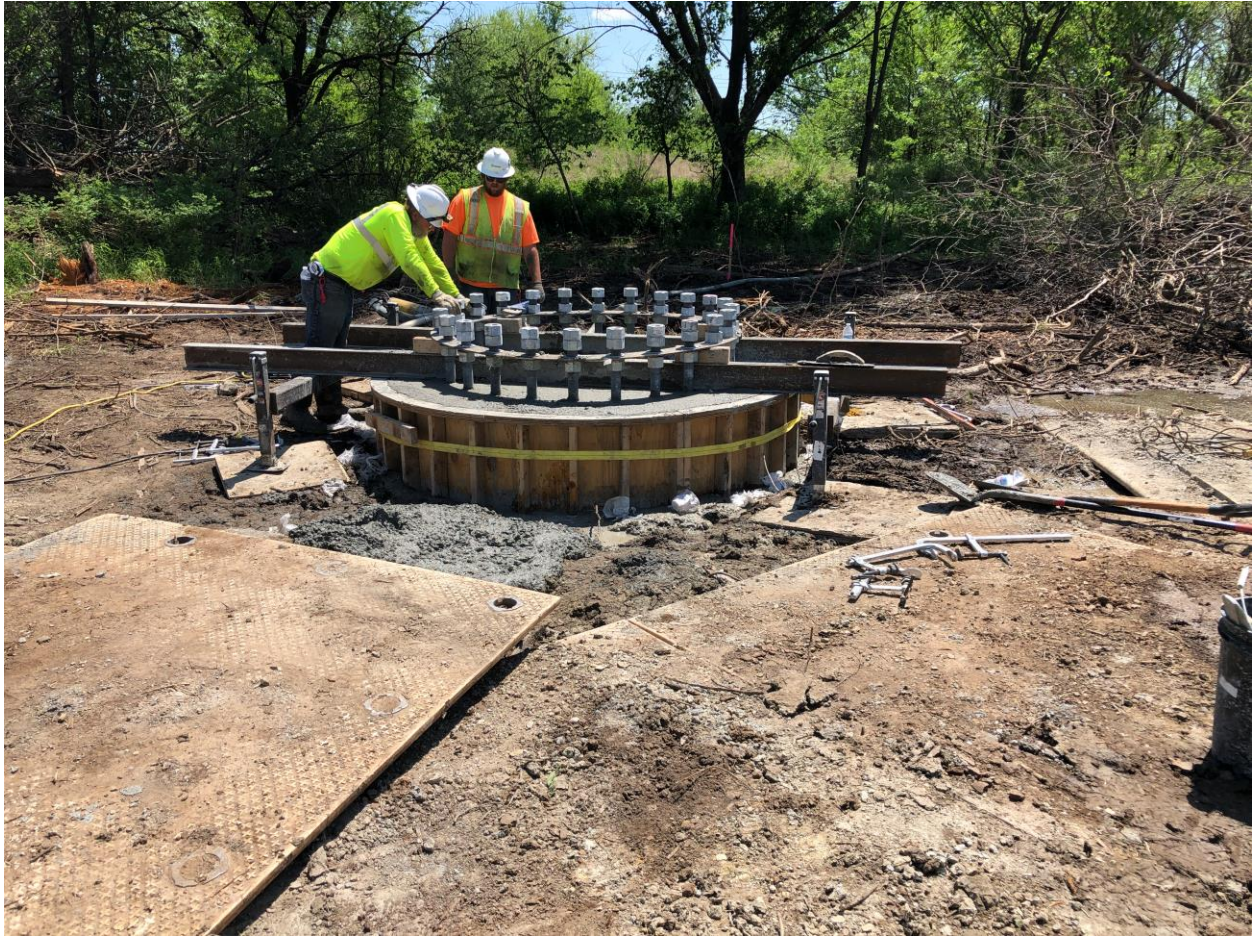
T-Line Foundation Structure