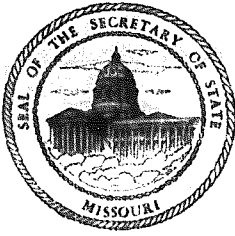
EXHIBIT 1 Page 1