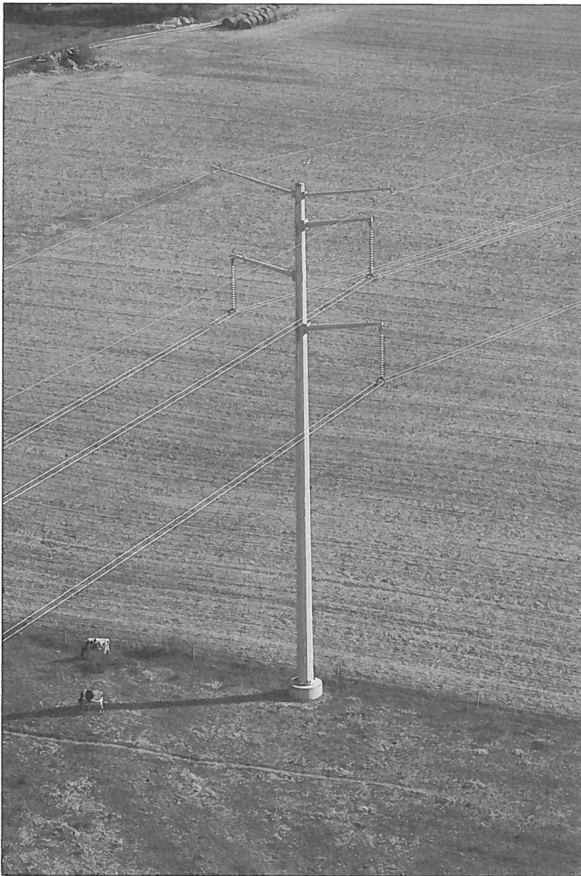
Front RUSH ISLAND - BALDWIN