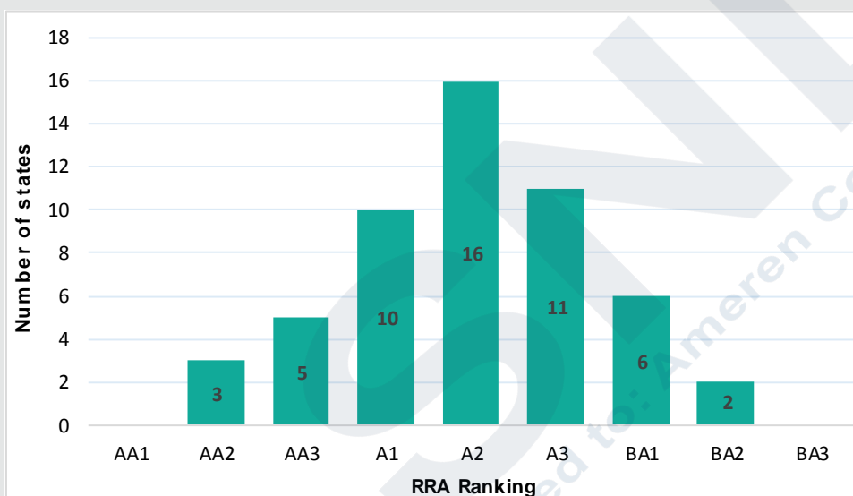
RRA state regulatory rankings - July 21, 2016