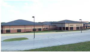
Jefferson City Public School – Pioneer Trail Elementary School – Jefferson City, Missouri