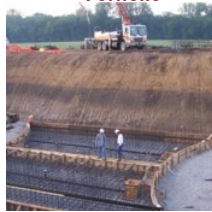
CITY OF MILAN WASTEWATER TREATMENT PLANT Geotechnical Engineering