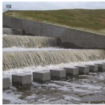
CITY OF MARCELINE OLD EAST RESERVOIR SPILLWAY AND DAM REPAIRS Geotechnical Engineering