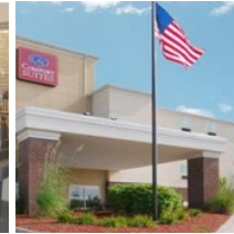
COMFORT SUITES HOTEL – COLUMBIA, MISSOURI Structural Engineering