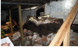
Residential Basement Wall Collapse