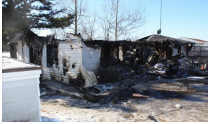
House Fire-Electrical Caused Fire