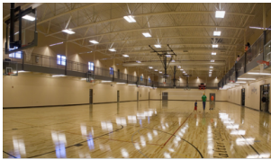
Mexico YMCA Gym Building Addition & Renovation – Mexico, Missouri