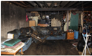
House Fire-Electrical Caused Fire