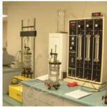
CITY OF HUNTSVILLE WASTEWATER STORAGE LAGOON Geotechnical Engineering