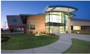
Branson Recreation Center – Branson, Missouri