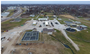
Brookfield Wastewater Treatment Facility – under construction