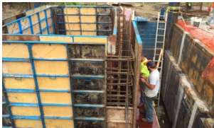
New Franklin Wastewater Treatment Facility Improvements