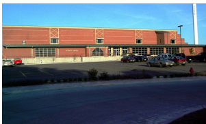
Linn State Technical College Activity Center, Includes FEMA Shelter – Linn, Missouri