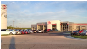
Riley Toyota – Jefferson City, Missouri