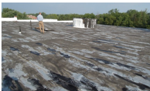
Commercial Roof-Wind Damage