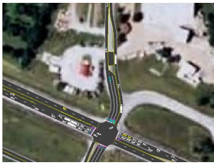
US 50/Oak Grove Lane/West Main Street