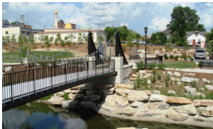
Flat Branch Pedestrian Bridge – Columbia, Missouri