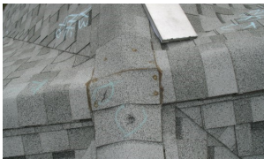
Roof Evaluation- Hail Damage