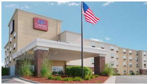
Comfort Suites Hotel – Columbia, Missouri