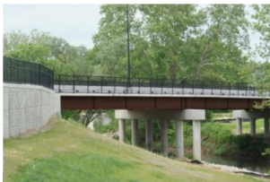
Vandiver Drive Extension