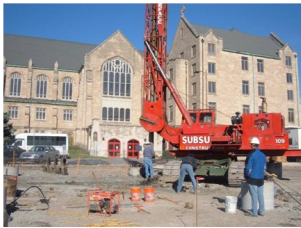
Missouri United Methodist Church Addition