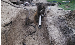
Auxvasse Drinking Water Supply Distribution Improvements