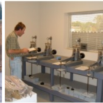
COLUMBIA SANITARY LANDFILL ADMINISTRATION, MAINTENANCE AND VEHICLE STORAGE FACILITIES Geotechnical Engineering