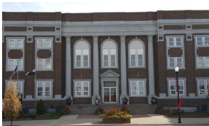
Chillicothe City Hall Moisture Infiltration and Structural Evaluation