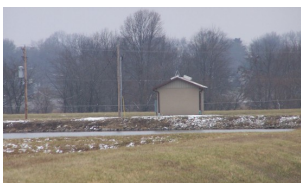
1500 GPM Booster Pump Station