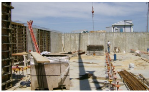
Wardsville Water System Improvements