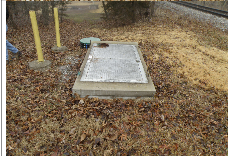
Photograph #: 6 Entity: BCRSD Brown Station WWTP Permit: #MO-0135305 Location: Boone County Description: Photo shows the concrete structure built to accommodate an ultraviolet light disinfection system in the future if needed. Taken facing north. Date Taken: January 14, 2020 Program: WPC Unit