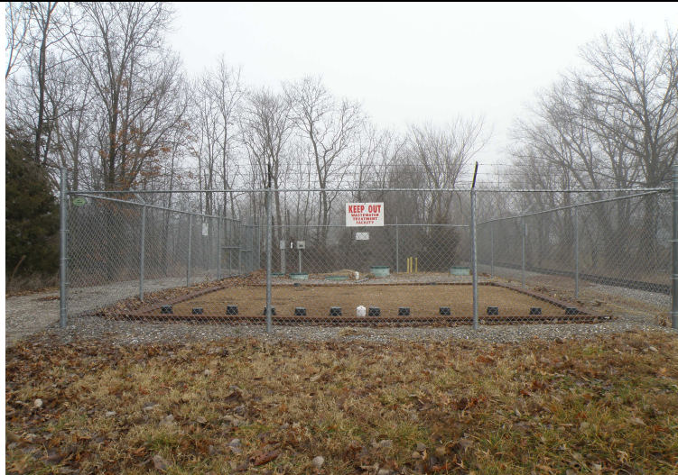
Photograph #: 2 Entity: BCRSD Brown Station WWTP Permit: #MO-0135305 Location: Boone County Description: Photo shows the perimeter fence around the facility with warning signs posted on each side of the fence. Taken facing north. Date Taken: January 14, 2020 Program: WPC Unit