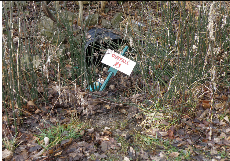
Photograph #: 8 Taken by: Josh Hufford Entity: BCRSD Brown Station WWTP Permit: #MO-0135305 Location: Boone County Description: Photo shows the outfall was clearly marked in the field with a sign. Taken facing west. Date Taken: January 14, 2020 Program: WPC Unit