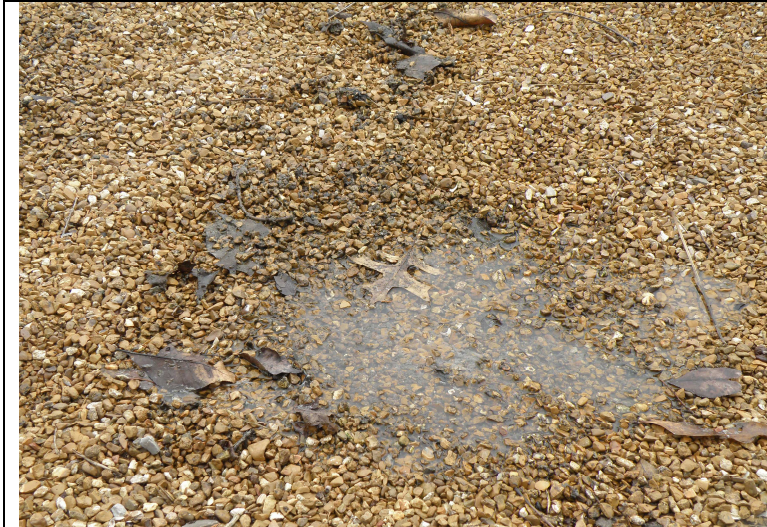
Photograph #: 5 Entity: BCRSD Brown Station WWTP Permit: #MO-0135305 Location: Boone County Description: Photo shows a closer view of the wastewater pooling on the surface of the sand filter. Date Taken: January 14, 2020 Program: WPC Unit