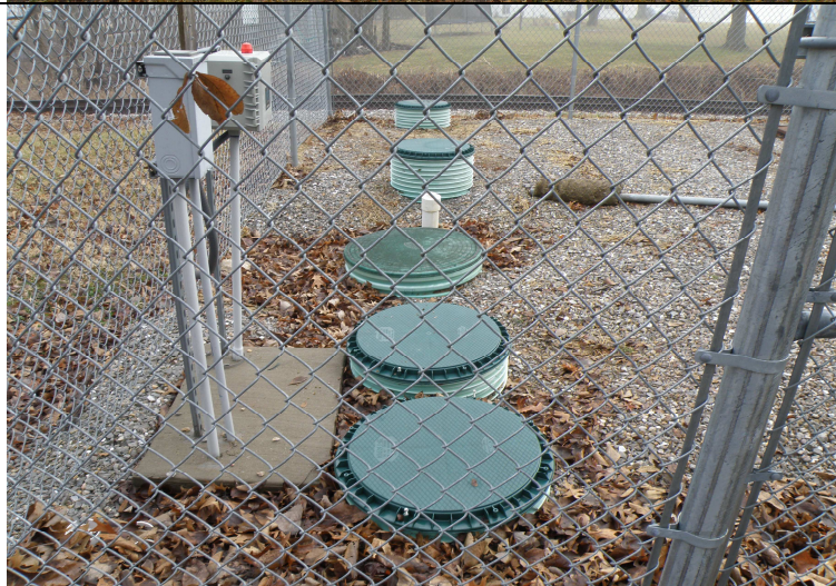
Photograph #: 3 Entity: BCRSD Brown Station WWTP Permit: #MO-0135305 Location: Boone County Description: Photo shows the recirculation and septic tanks. Taken facing east. Date Taken: January 14, 2020 Program: WPC Unit