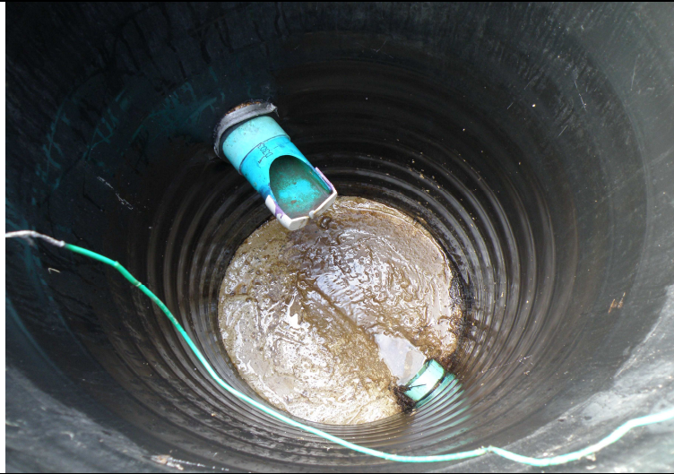
Photograph #: 7 Entity: BCRSD Brown Station WWTP Permit: #MO-0135305 Location: Boone County Description: Photo shows the facility's sampling location, which follows the final treatment process. The facility is discharging and samples were collected at this location. Date Taken: January 14, 2020 Program: WPC Unit