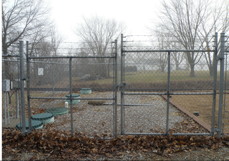
Photograph #: 1 Entity: BCRSD Brown Station WWTP Permit: #MO-0135305 Location: Boone County Description: Photo shows the entrance gate was secured with a lock. An appropriate warning sign is posted next to the gate. Taken facing east. Date Taken: January 14, 2020 Program: WPC Unit