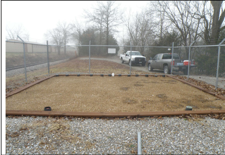
Photograph #: 4 Taken by: Josh Hufford Entity: BCRSD Brown Station WWTP Permit: #MO-0135305 Location: Boone County Description: Photo shows pooling on the surface of the media bed. Taken facing south. Date Taken: January 14, 2020 Program: WPC Unit