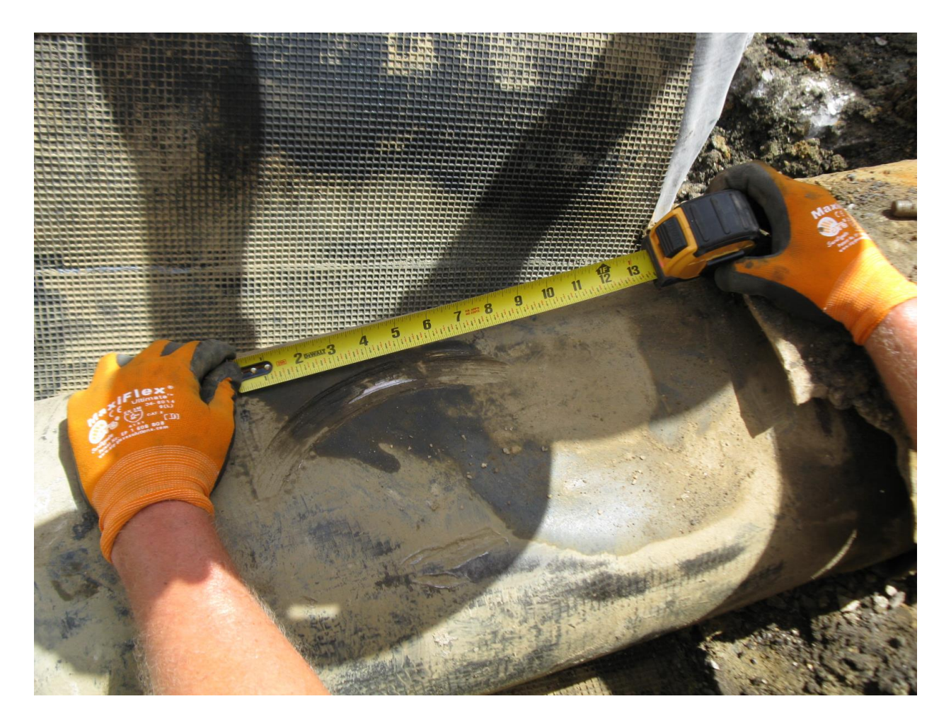
Photograph 5: Photograph of the damage to the pipeline.