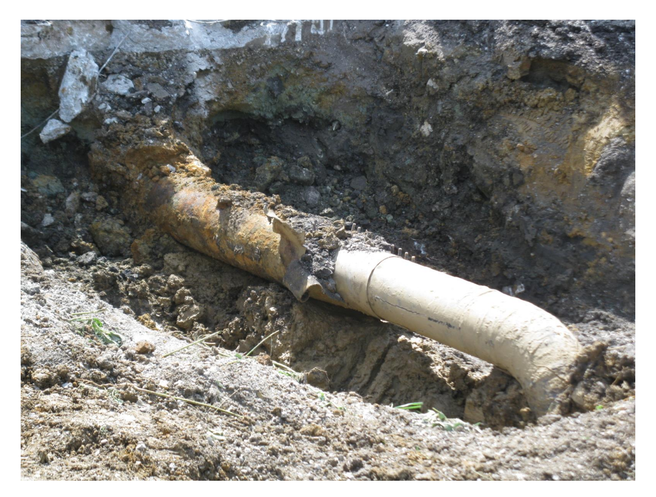
Photograph 4: Photograph of the damaged portion of the pipeline looking southeast. A repair clamp is surrounding the damaged portion of the pipeline.