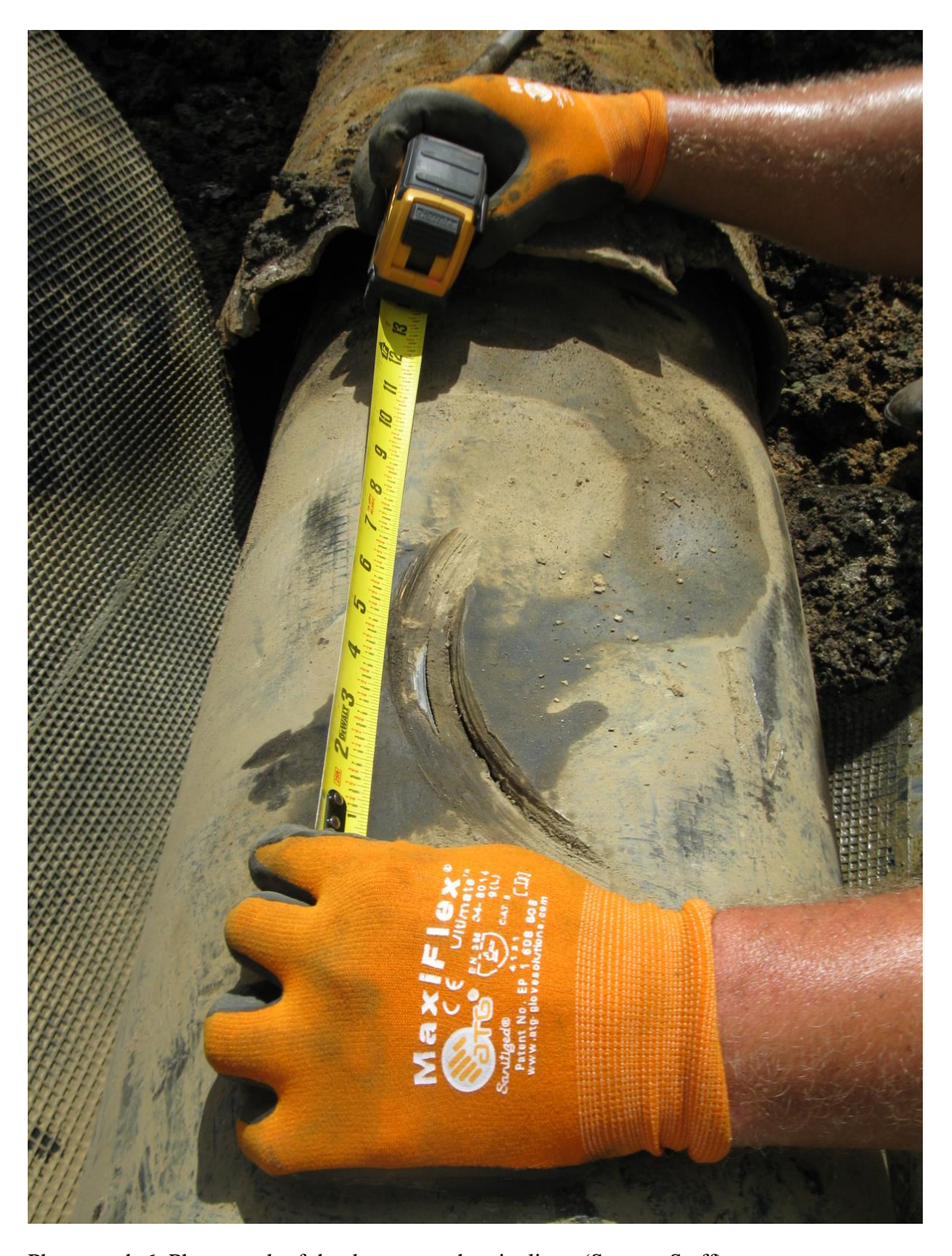
Photograph 6: Photograph of the damage to the pipeline.