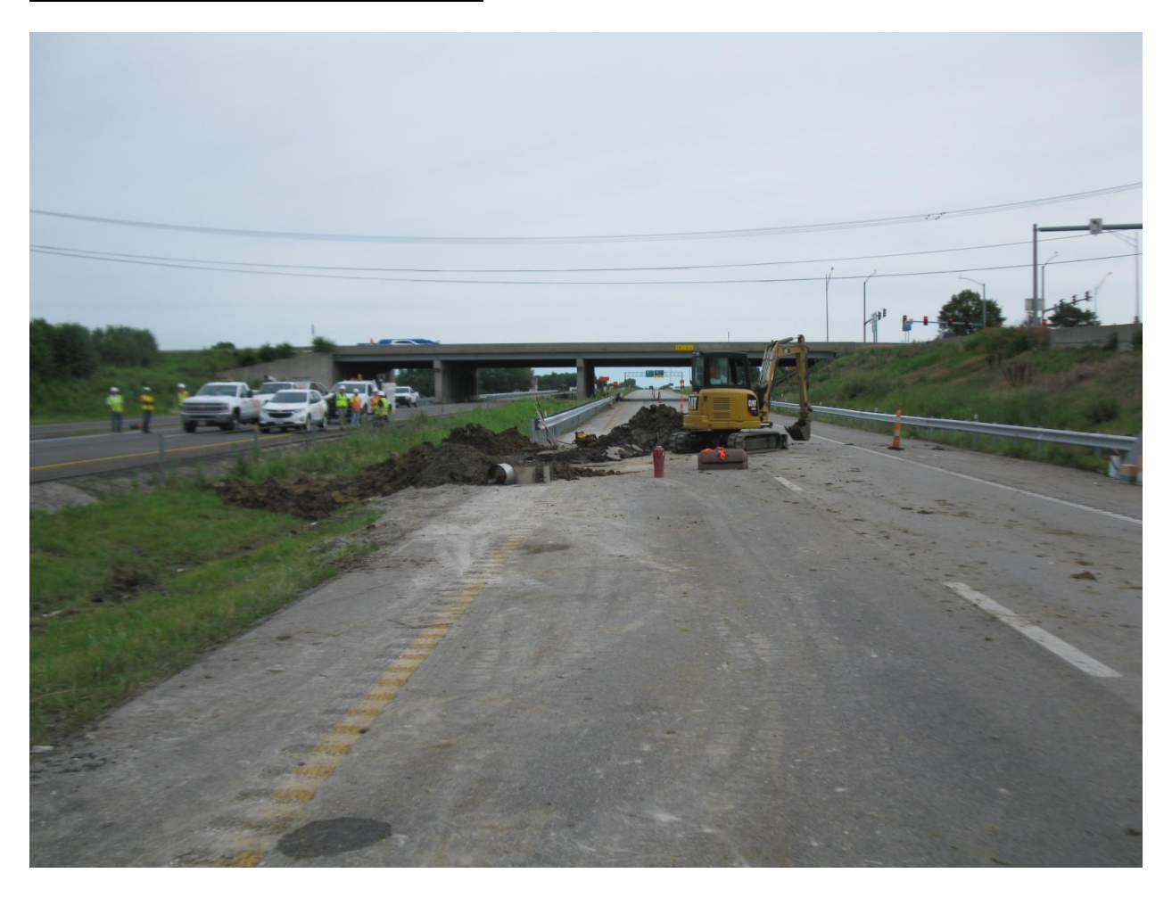
Photograph 1: Photograph looking north along the northbound lanes of U.S. Route 169 toward Northwest Barry Road overpass. The excavation in the median contains the damaged pipeline.