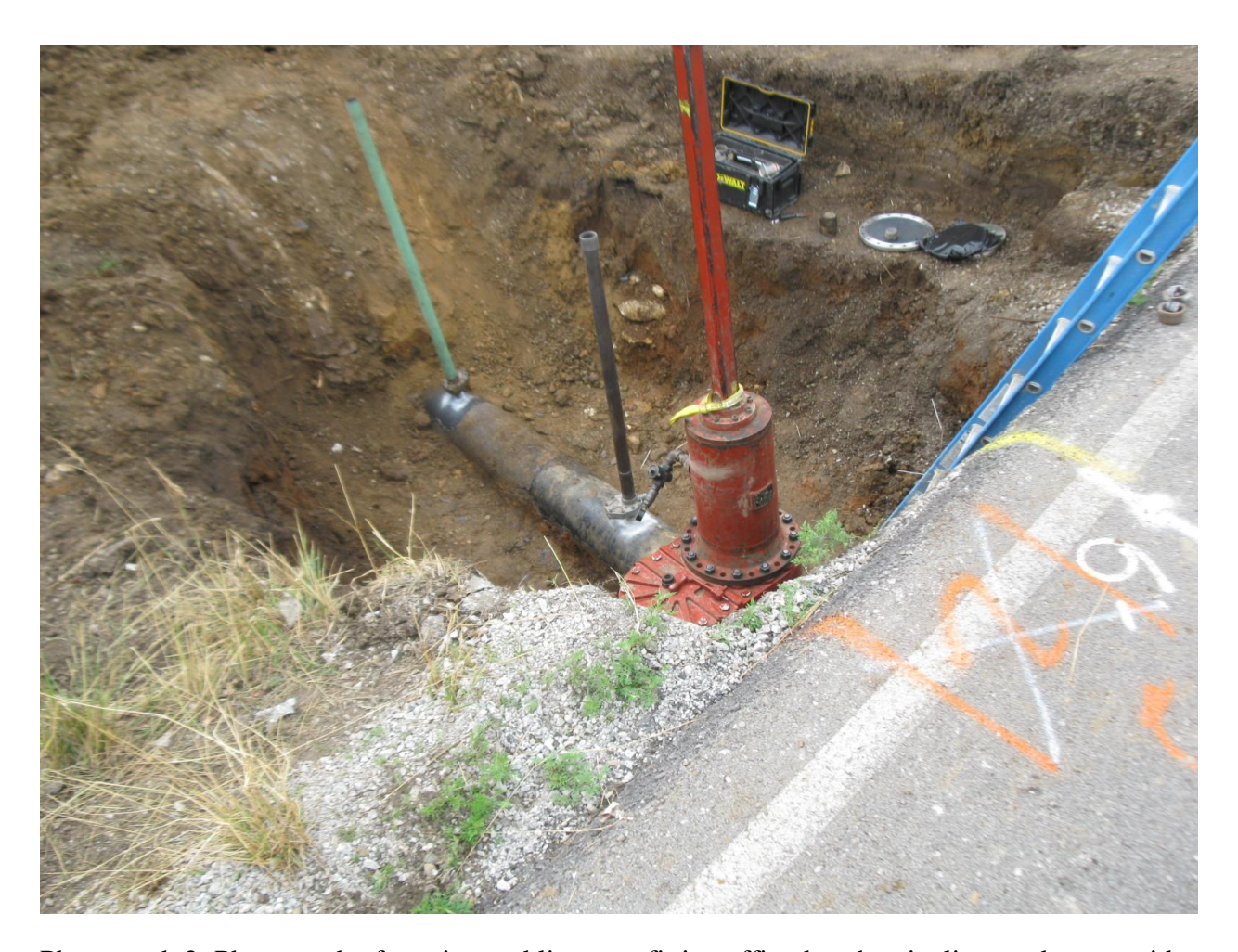
Photograph 2: Photograph of tapping and line stop fitting affixed to the pipeline on the west side of U.S. Route 169.