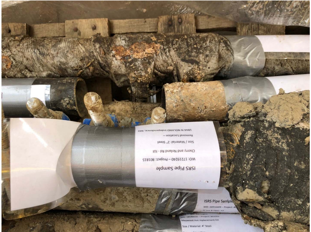
Figure 23, Spire West, Bare Steel, Work Order #17219240