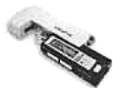
MuVo® TX FM

Creative also offers these sporty flash MP3 players starting at only $79.99!