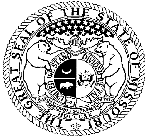
Secretary of State

Certification Number: 12246378-1 Reference: Verify this certificate online at http://www.sos.mo.gov/businessentity/verification