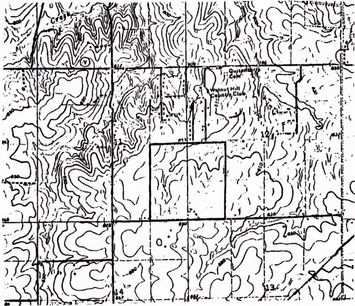
Map of Service Area

Service Area: All Missouri Service Areas