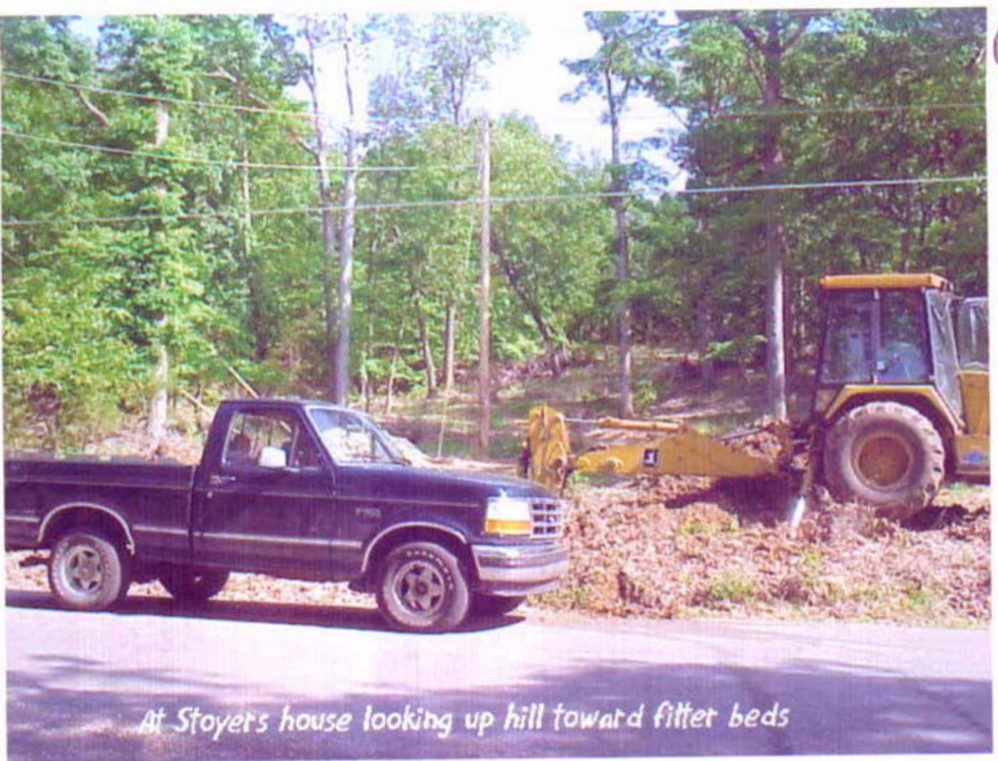
At Stoyers house looking up hill toward filter beds