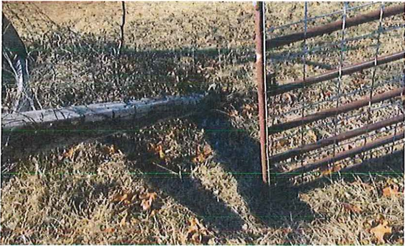
2 Failing Fence Around Lagoon Storage