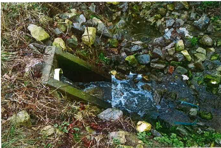
Photo #: 014 By: Tim Mattingly Facility: Hillcrest Manor Permit: MO-0088072 Location: Cape Girardeau County

Description: This photo show outfall #001 for the facility. The effluent was clear with no odor.