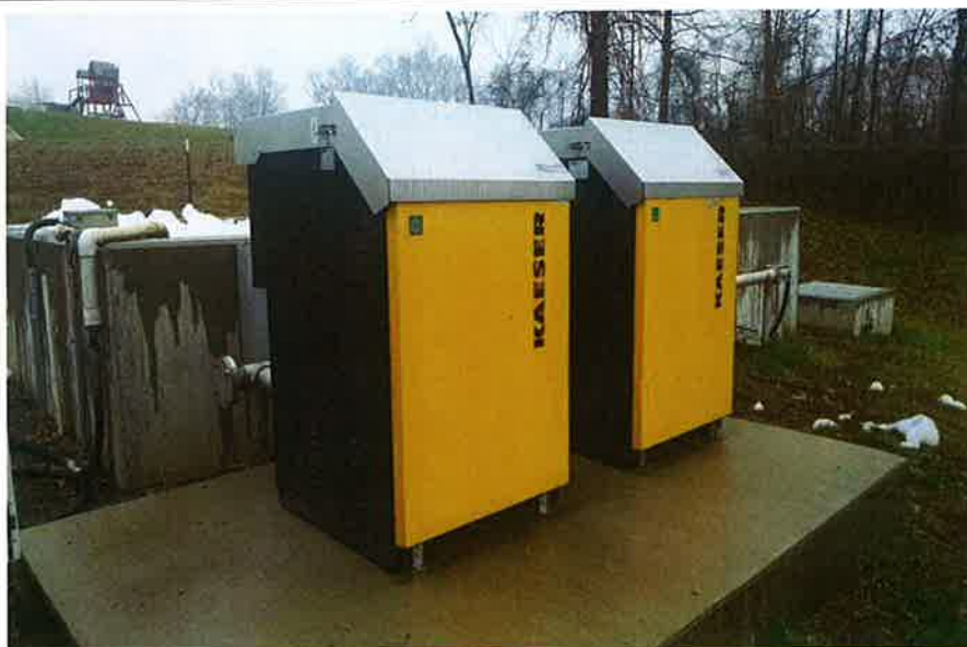
Photo #: 006 Facility: Hillcrest Manor Permit: MO-0088072 Location: Cape Girardeau County

Description: These are the two blowers that provide the air for the moving bed biofilm reactor. Their usage alternates between the two.