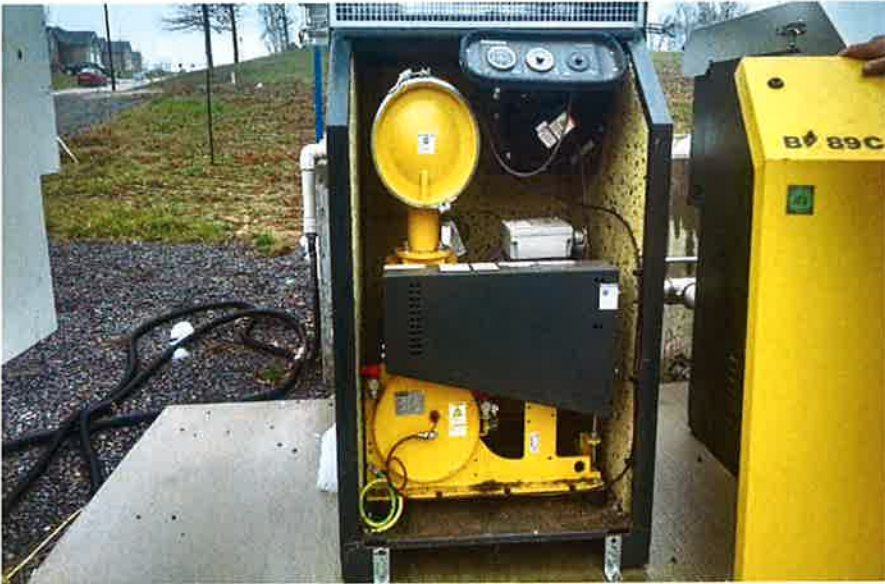
Photo #: 007 Facility: Hillcrest Manor Permit: MO-0088072 Location: Cape Girardeau County

Description: A picture of the internal components of the individual blowers.