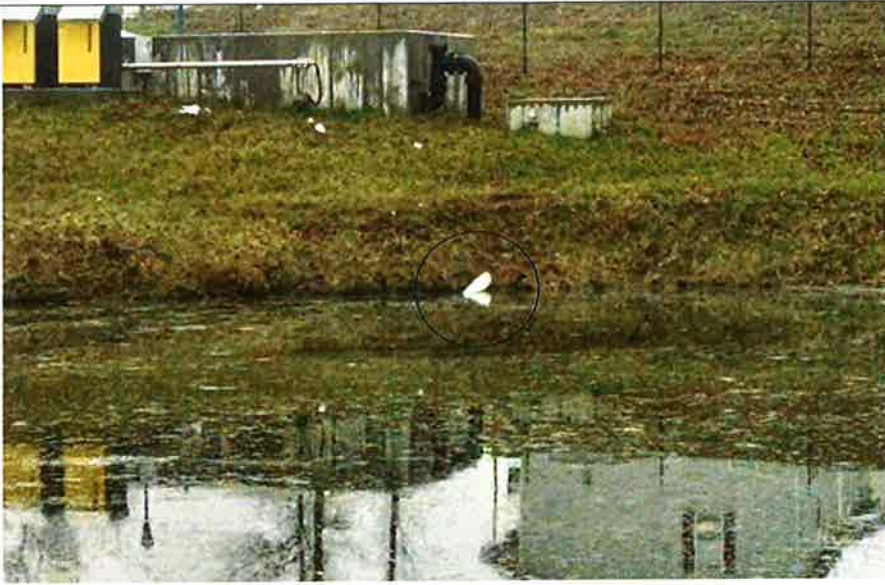
Photo #: 010 Facility: Hillcrest Manor Permit: MO-0088072 Location: Cape Girardeau County

Description: The pipe in the center of the circle is the pipe through which the wastewater travels from the weir box into the polishing cell.