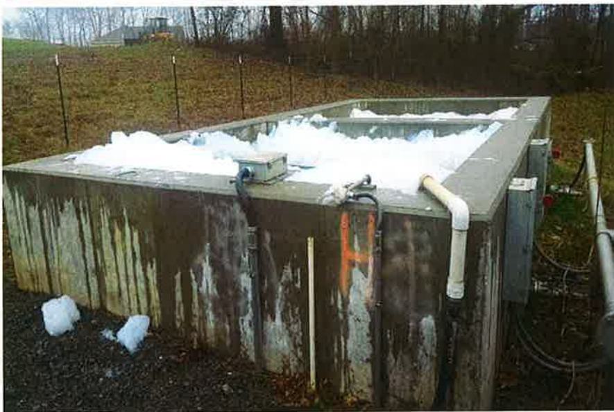
Photo #: 005 Facility: Hillcrest Manor Permit: MO-0088072 Location: Cape Girardeau County

Description: This is a photo of the moving bed biofilm reactor. The foam seen here is minimal, only occurring during extreme temperature fluctuations or periods of rain.