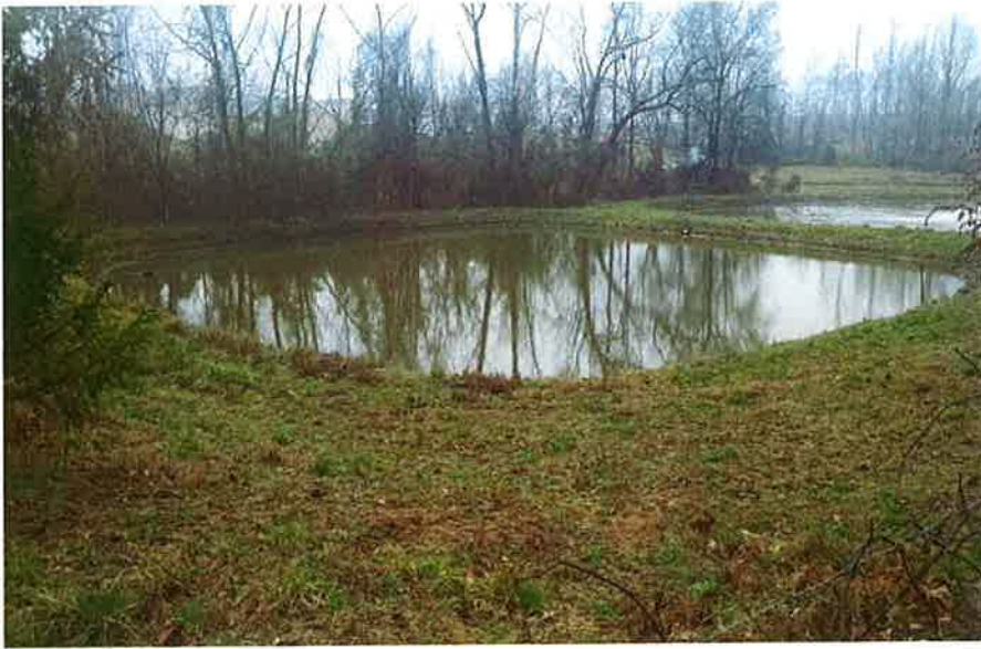
Photo #: 001 Facility: Hillcrest Manor Permit: MO-0088072 Location: Cape Girardeau County

Description: This is a photo of the primary cell of the lagoon system at Hillcrest Manor Subdivision.