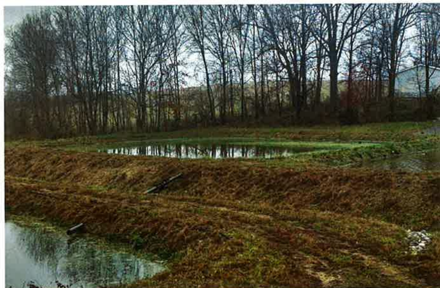
Photo #: 003 Facility: Hillcrest Manor Permit: MO-0088072 Location: Cape Girardeau County

Description: A photograph of the third cell of the Hillcrest Manor Subdivision. The pipe seen is for emergency maintenance on the second or third cells.