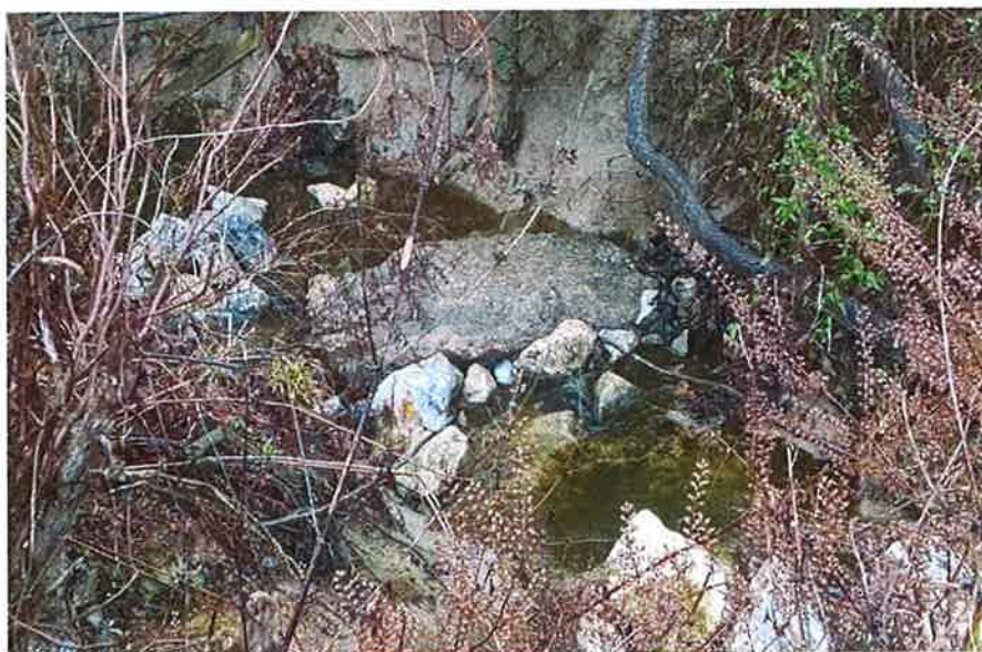
Photo #: 015 Facility: Hillcrest Manor Permit: MO-0088072 Location: Cape Girardeau County

Description: This is a picture of the receiving stream downstream of the WWTF. It had a low flow with a little algae growth. This stream also receives drainage for the subdivision just prior to the area where this photo was taken.