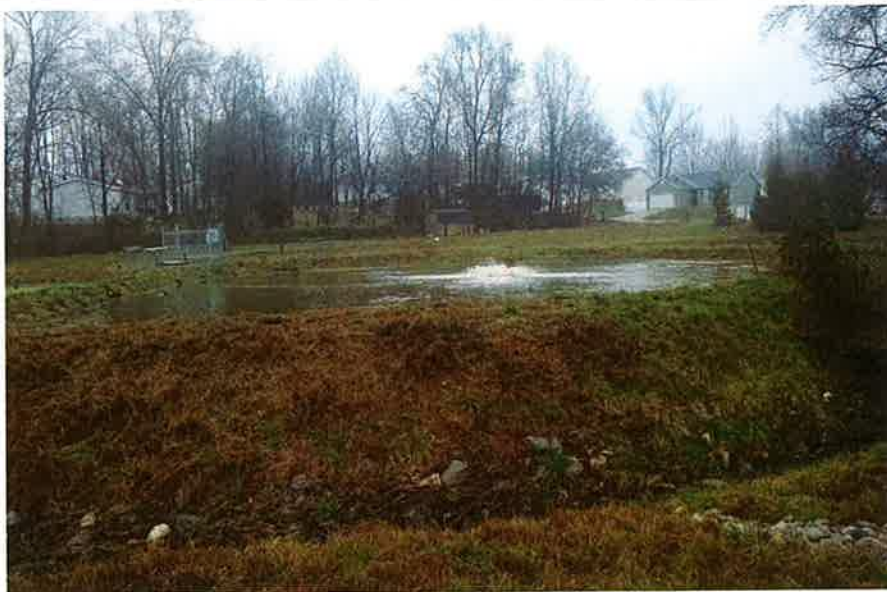
Photo #: 002 Facility: Hillcrest Manor Permit: MO-0088072 Location: Cape Girardeau County

Description: The second cell of the lagoon serving Hillcrest Manor Subdivision. The aerator was fully functional.