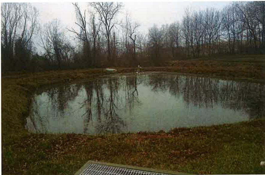
Photo #: 011 Facility: Hillcrest Manor Permit: MO-0088072 Location: Cape Girardeau County

Description: This photo is a view of the polishing cell.