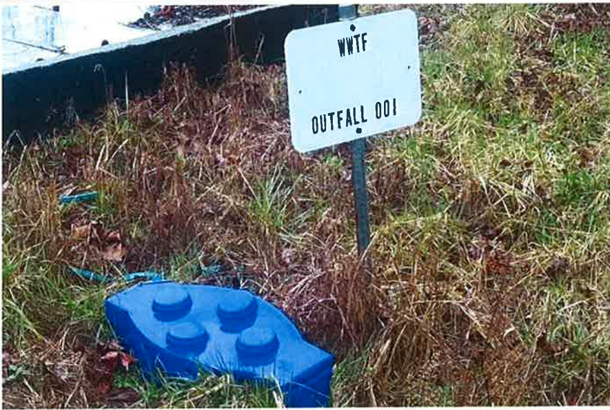
Photo #: 013 Facility: Hillcrest Manor Permit: MO-0088072 Location: Cape Girardeau County

Description: The blue box in this picture is the tablet de-chlorination unit. Obviously, the facility's outfall sign is also seen.