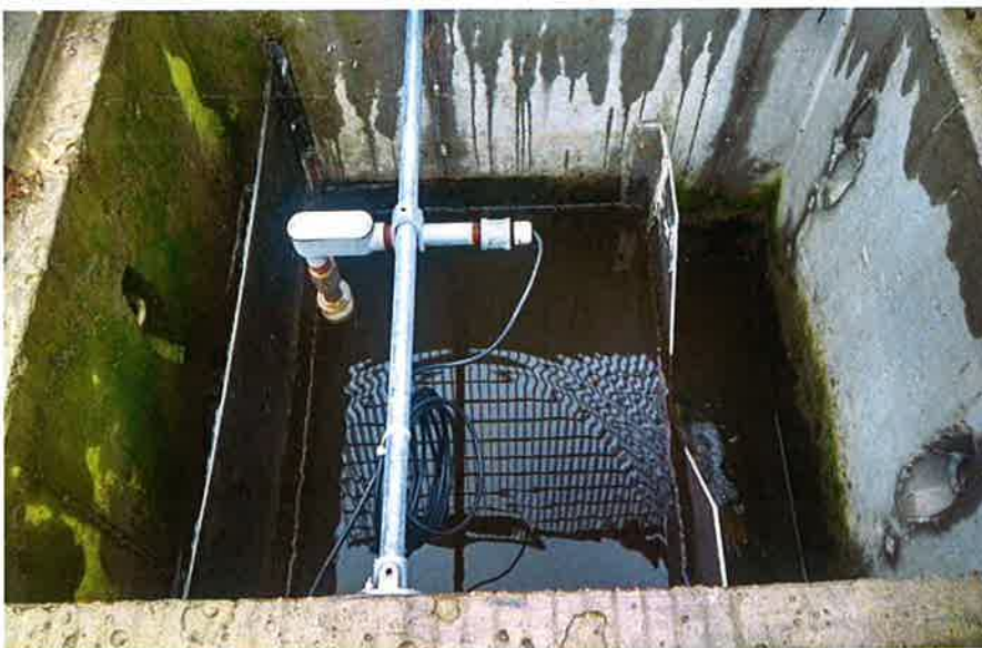
Photo #: 009 Facility: Hillcrest Manor Permit: MO-0088072 Location: Cape Girardeau County

Description: This is the interior of the weir box.