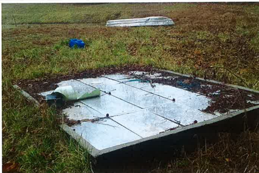
Photo #: 012 Facility: Hillcrest Manor Permit: MO-0088072 Location: Cape Girardeau County

Description: This is a photograph of the chlorine contact chamber. The blue box at the top of the picture is the tablet chlorinator.