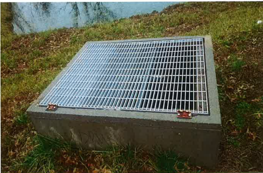
Photo #: 008 By: Tim Mattingly Facility: Hillcrest Manor Permit: MO-0088072 Location: Cape Girardeau County

Description: This is a photograph of the exterior of the weir box. The wastewater travels from the moving bed biofilm reactor to this structure.