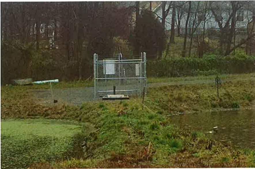
Photo #: 004 By: Tim Mattingly Facility: Hillcrest Manor Permit: MO-0088072 Location: Cape Girardeau County

Description: This small lift station is located between cells two and three and pumps wastewater from cell three to the moving bed biofilm reactor.