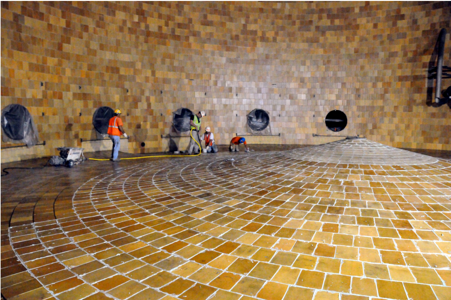
Inside of Unit 1 Absorber During Stebbins Tile Installation