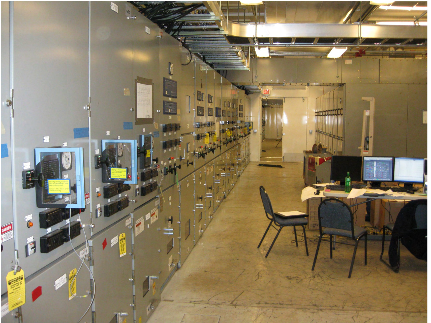
Some of the 4160V Breakers Inside the Main PDC Building