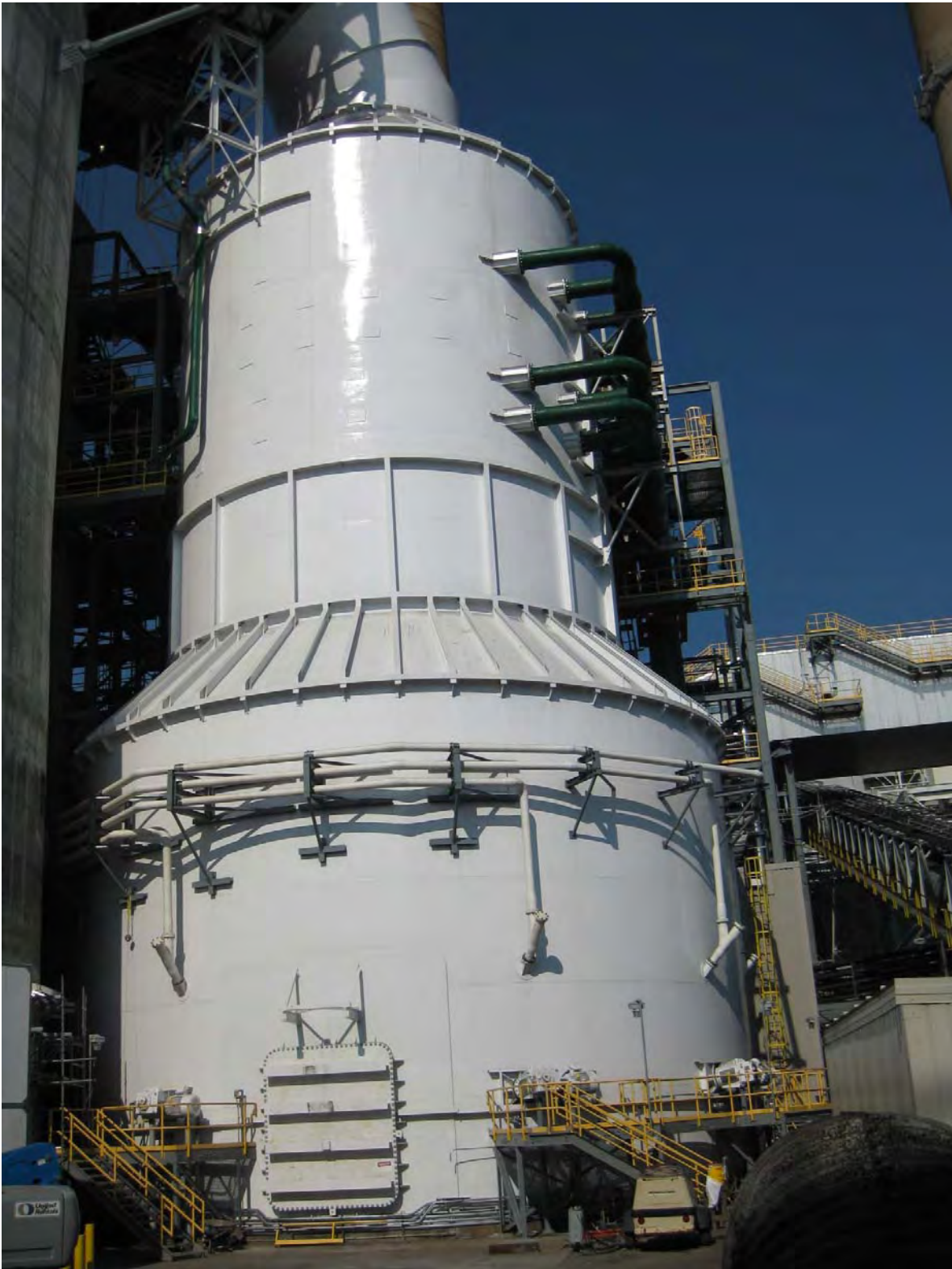
New Unit 1 Absorber Vessel