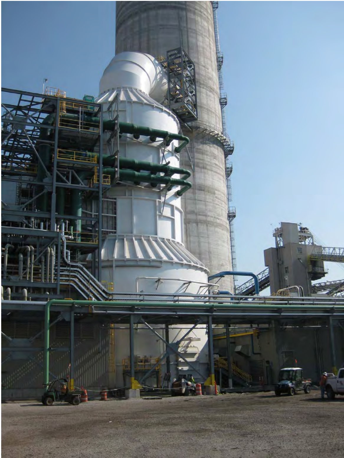
New Unit 2 Absorber Vessel