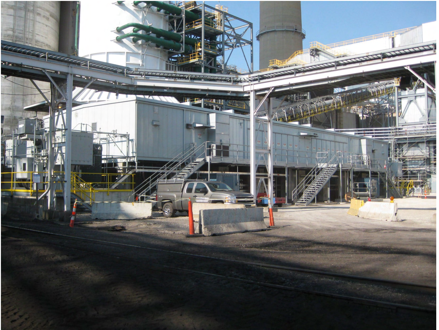
Another View of the Main PDC Building and Step-down Transformers