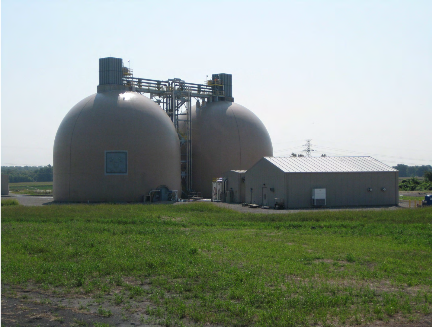
New Powdered Limestone Storage Facility