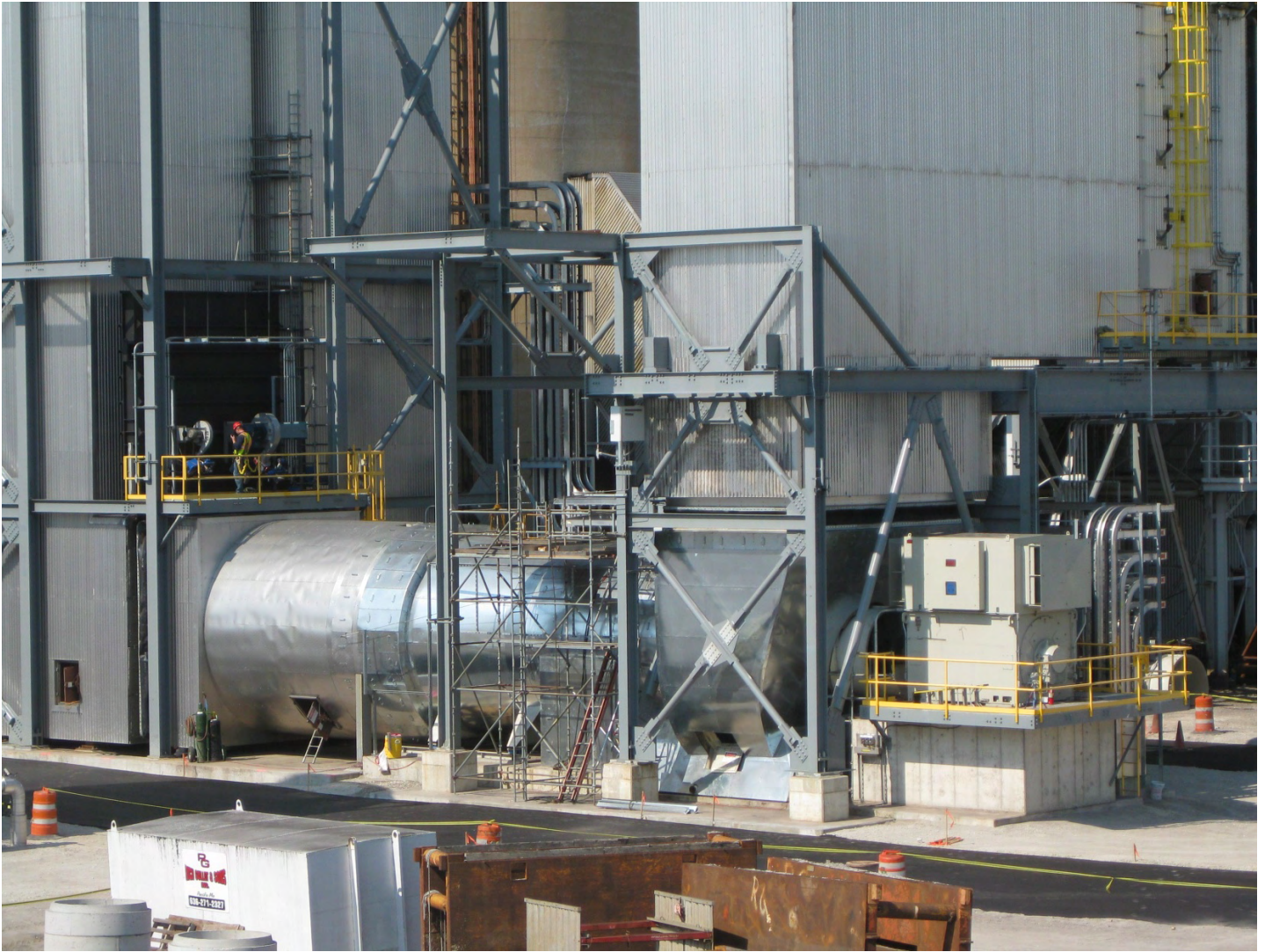
New Axial Induced Draft Fan