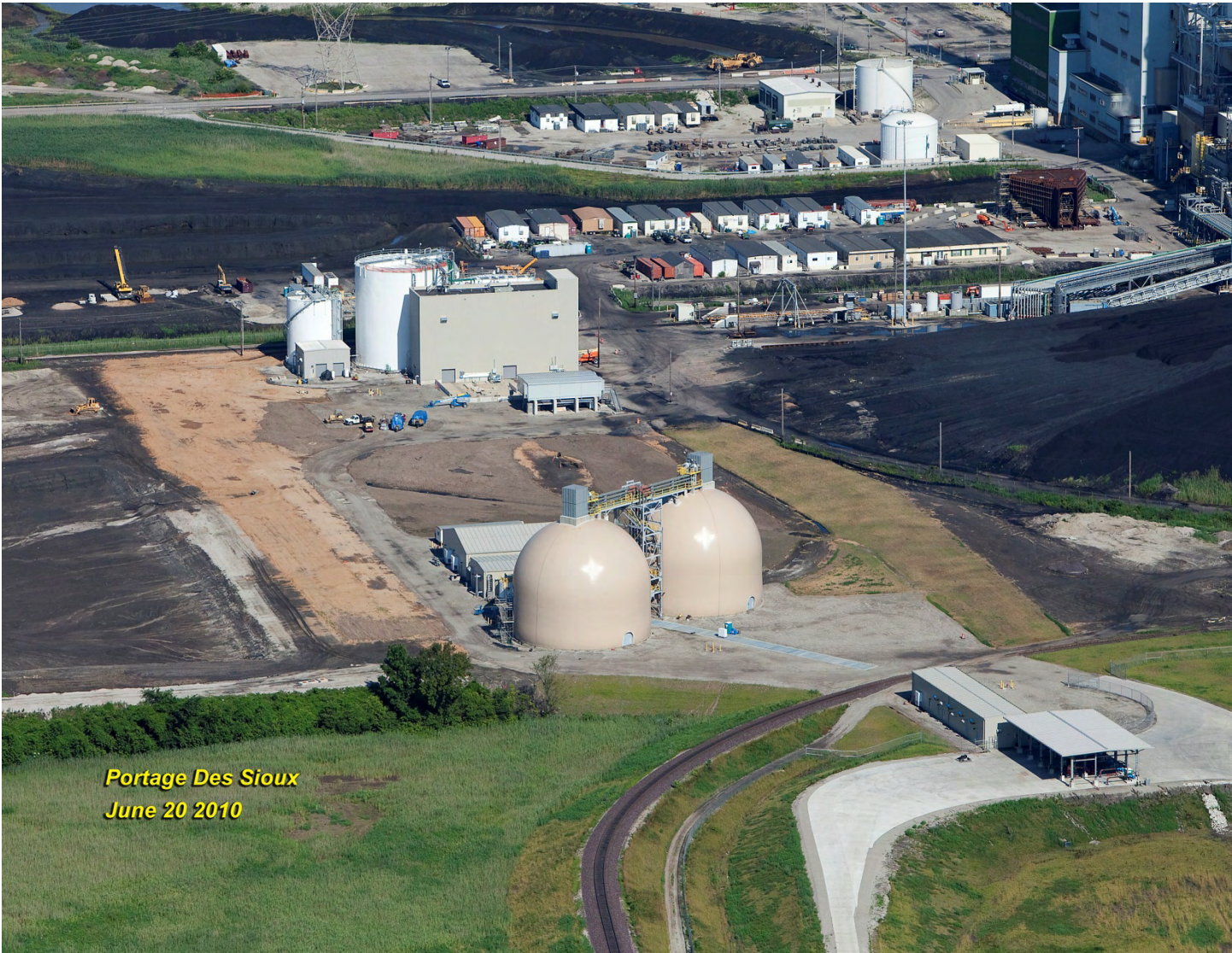
Aerial View of Truck Unloading Station, Powdered Limestone Facility, and Reactant Prep Area