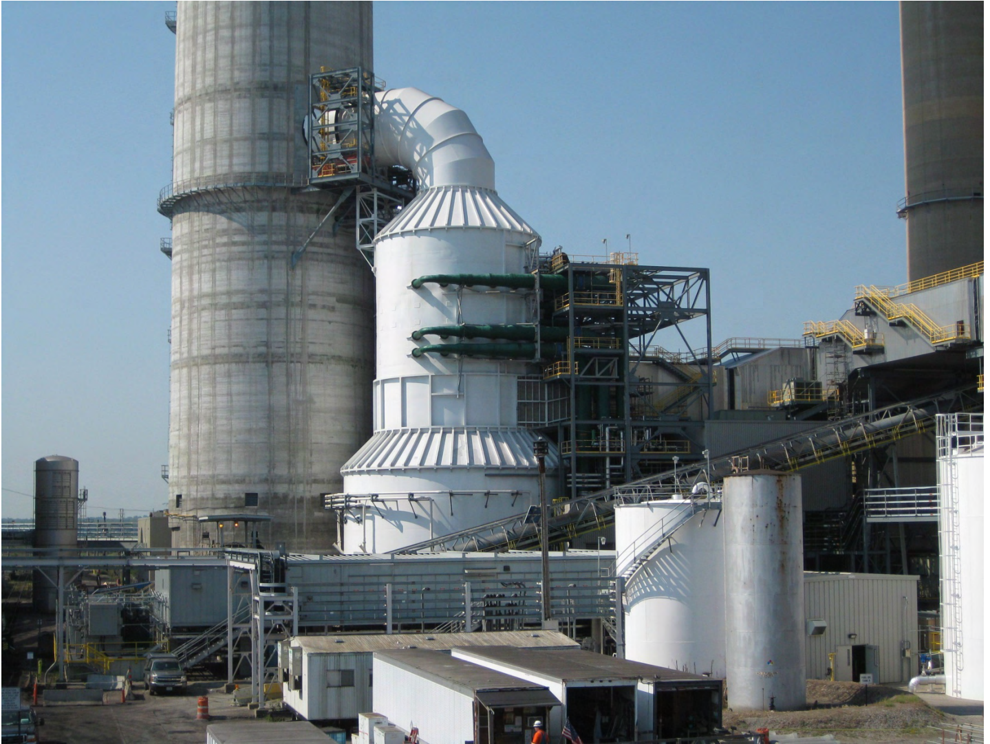
New Unit 1 Flue Gas Desulfurization System and Main Power Distribution Center (PDC) Building