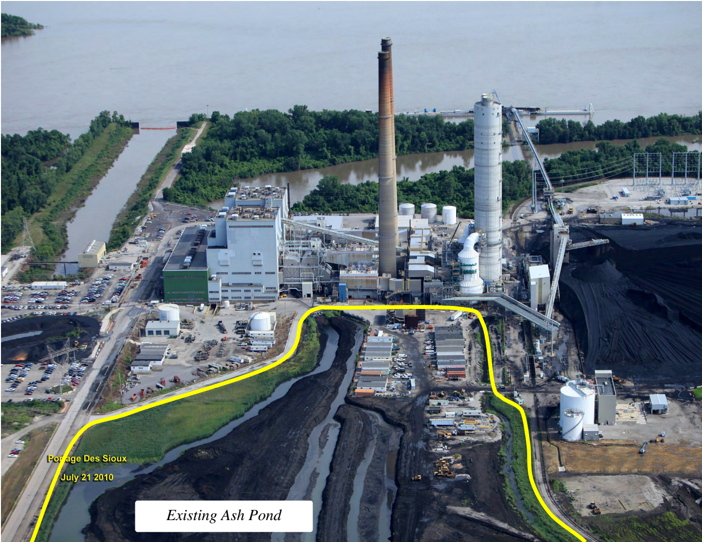
Aerial View of New Unit 2 Flue Gas Desulfurization System, note construction trailers and fabrication areas are on top of the existing fly ash pond