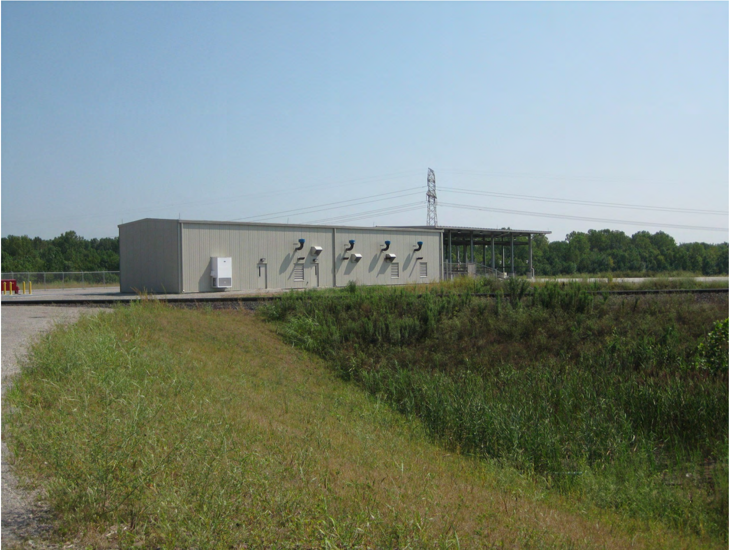
New Powdered Limestone Truck Unloading Facility