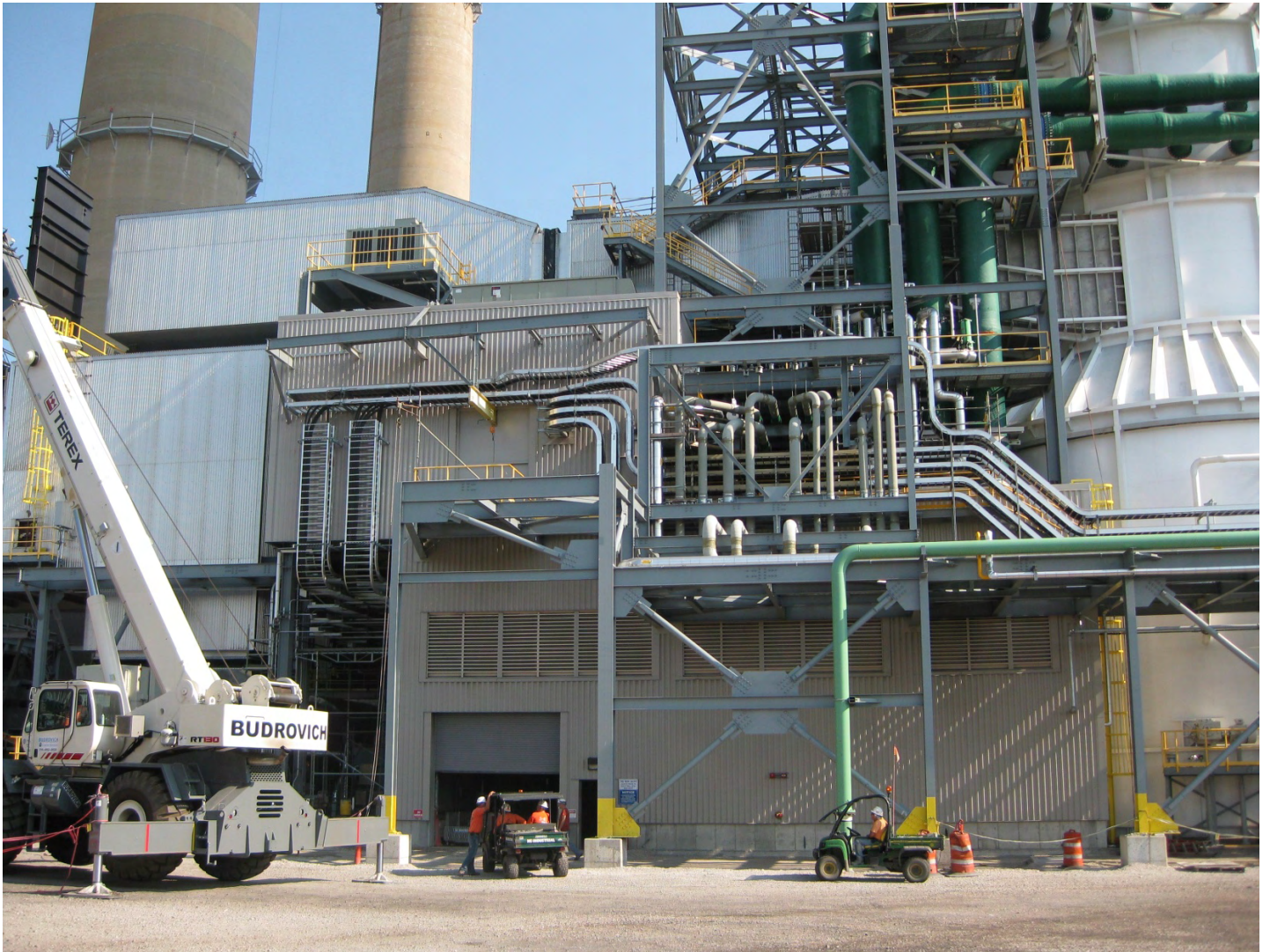
New Absorber Building As Seen From Unit 2 Side