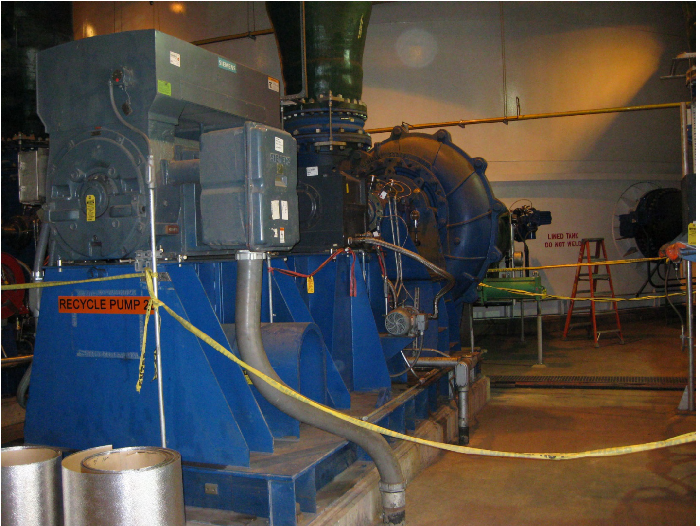
Closeup View of a Recycle Pump for Unit 2