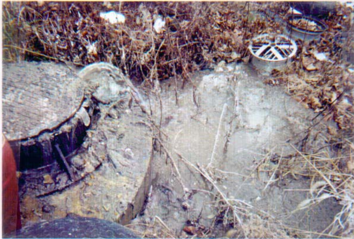
WARREN COUNTY WATER & SEWER – SHADY OAKS #1 MANHOLE WEST OF LIFT STATION - OVERFLOWING 1/22/02