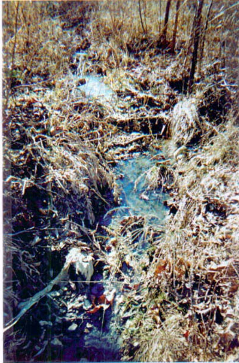
WARREN COUNTY WATER & SEWER – SHADY OAKS DITCH BELOW #1 MANHOLE 1/15/02