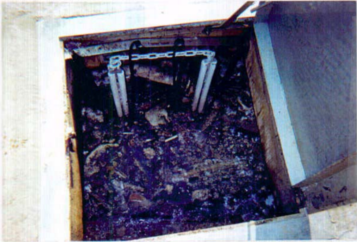
WARREN COUNTY WATER & SEWER – SHADY OAKS FULL WET WELL AT LIFT STATION 1/15/02