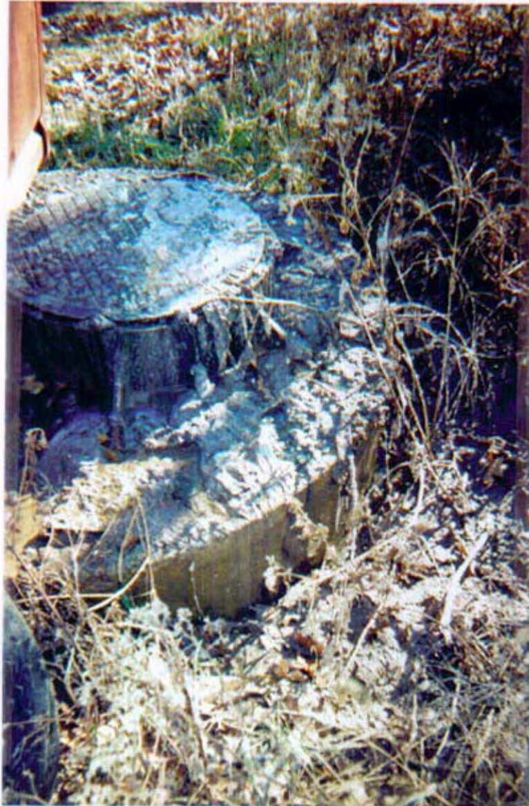
WARREN COUNTY WATER & SEWER – SHADY OAKS #1 MANHOLE WEST OF LIFT STATION - OVERFLOWING 1/15/02