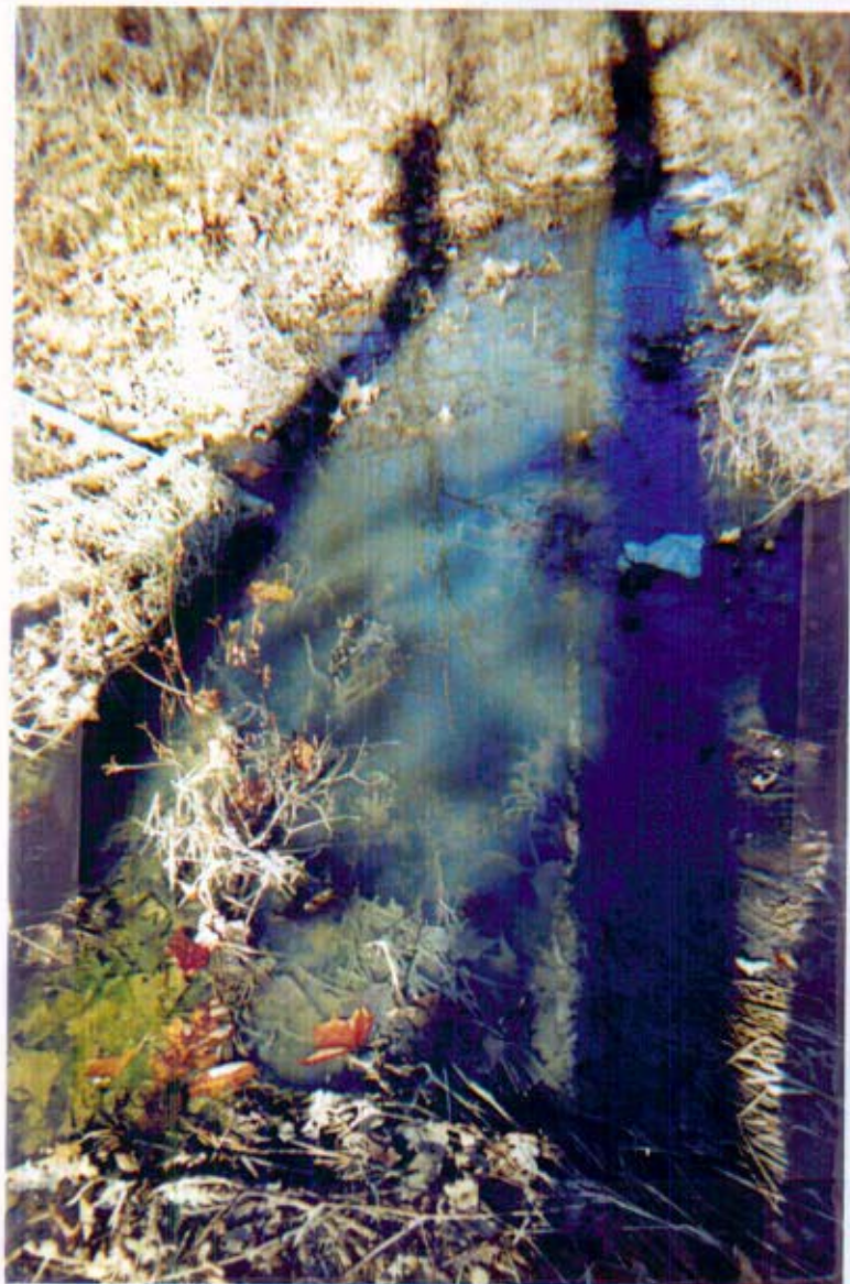
WARREN COUNTY WATER & SEWER – SHADY OAKS CREEK BELOW LIFT STATION & MANHOLE 1/15/02