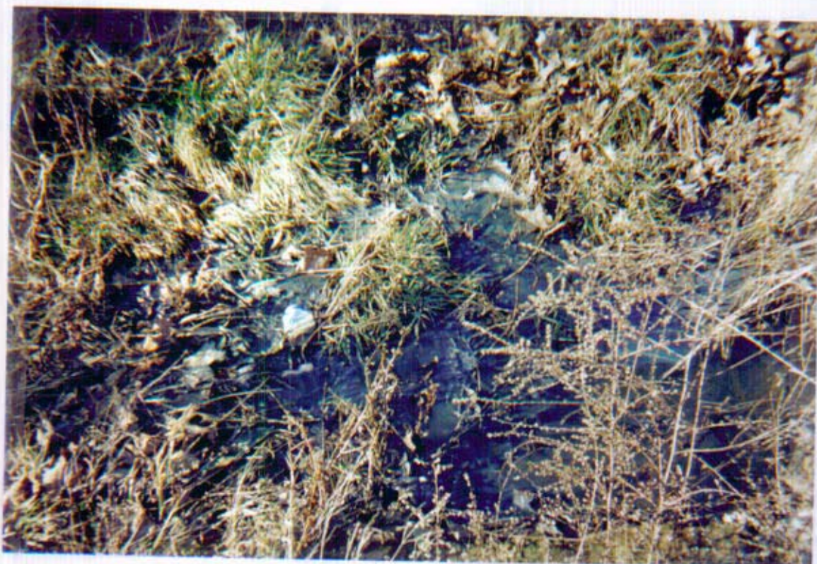
WARREN COUNTY WATER & SEWER – SHADY OAKS DITCH BELOW #1 MANHOLE 1/15/02