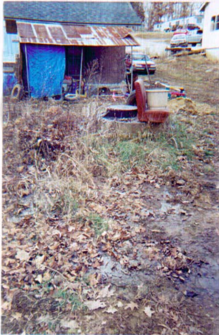
WARREN COUNTY WATER & SEWER – SHADY OAKS #1 MANHOLE WEST OF LIFT STATION - OVERFLOWING 1/22/02