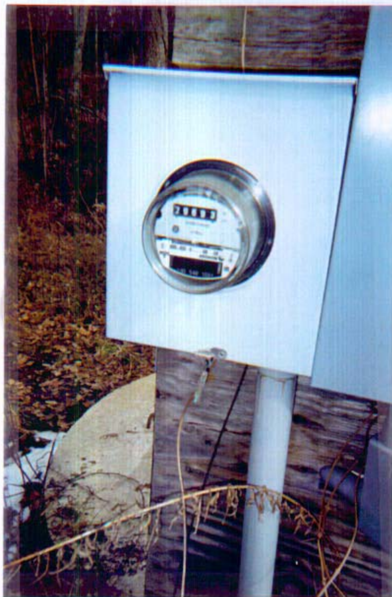
WARREN COUNTY WATER & SEWER – SHADY OAKS ELECTRIC METER @ 29693 A WEEK LATER 1/22/02