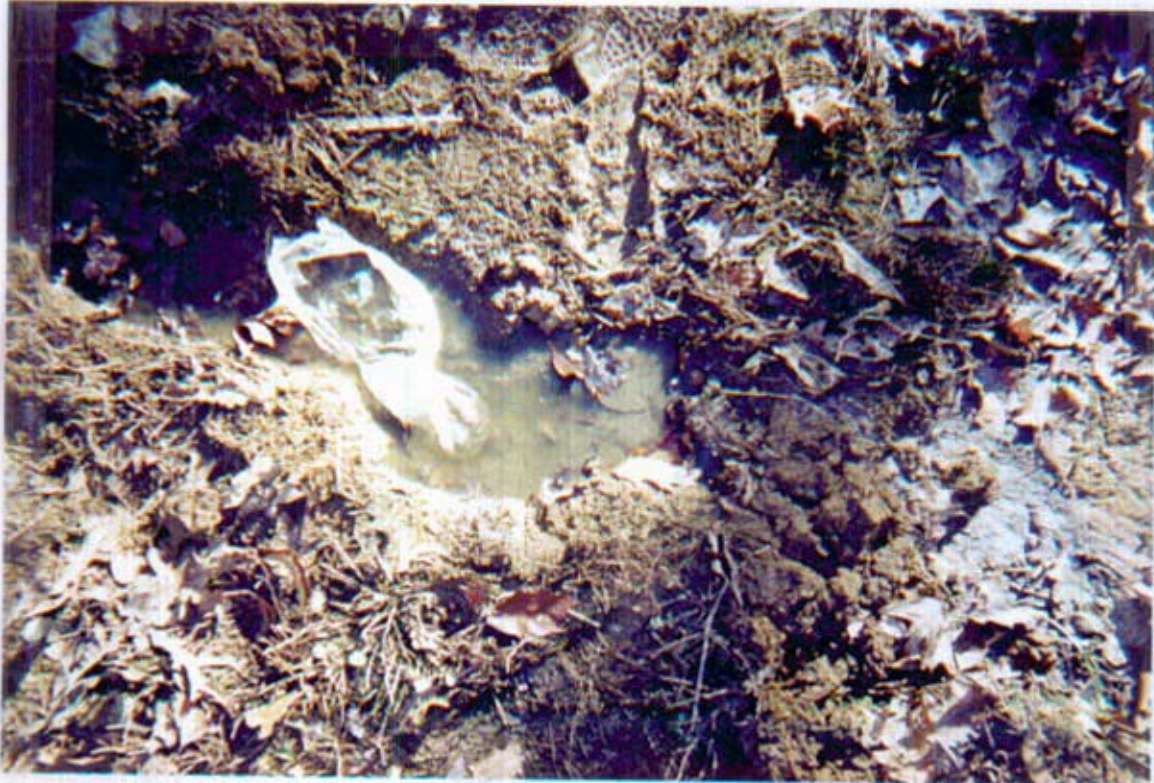
WARREN COUNTY WATER & SEWER – SHADY OAKS WASTEWATER FLOWING UP OUT OF GROUND EAST OF #1 MANHOLE, WHERE SAMPLE WAS COLLECTED 1/15/02