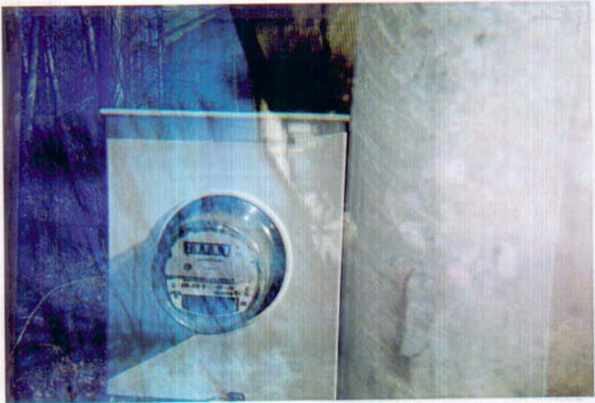
WARREN COUNTY WATER & SEWER – SHADY OAKS ELECTRIC METER @ 29693 1/15/02