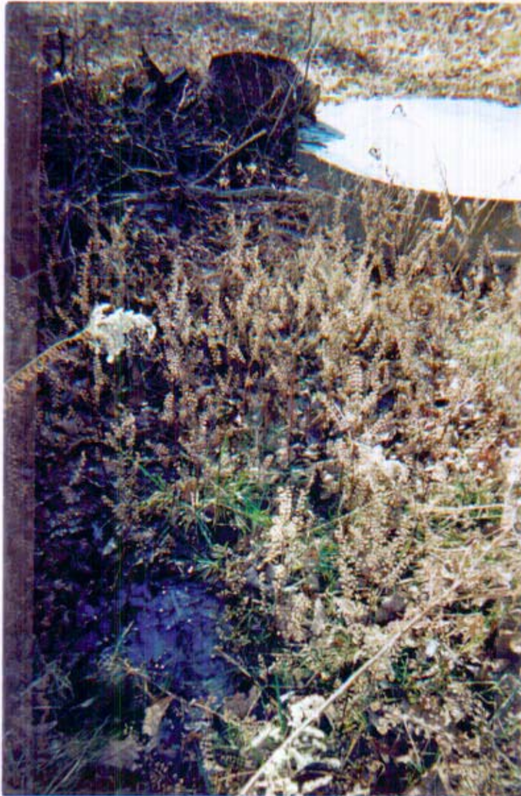
WARREN COUNTY WATER & SEWER – SHADY OAKS WASTEWATER FLOW FROM LIFT STATION 1/15/02