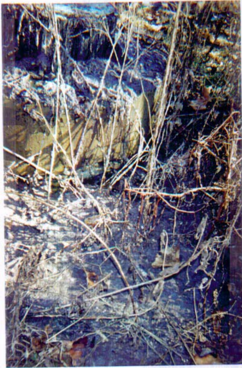
WARREN COUNTY WATER & SEWER – SHADY OAKS #1 MANHOLE WEST OF LIFT STATION - OVERFLOWING 1/15/02