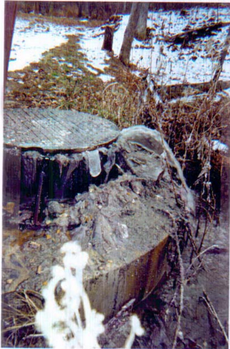
WARREN COUNTY WATER & SEWER – SHADY OAKS #1 MANHOLE WEST OF LIFT STATION - OVERFLOWING 1/22/02