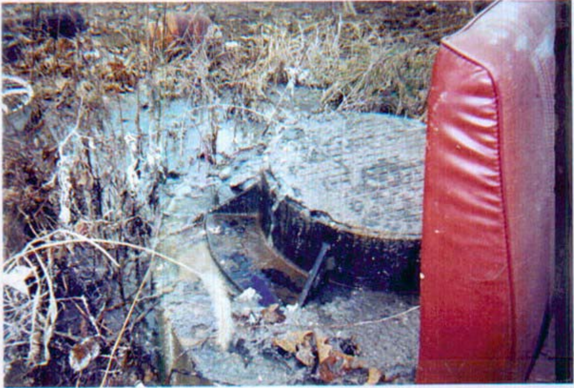
WARREN COUNTY WATER & SEWER – SHADY OAKS #1 MANHOLE WEST OF LIFT STATION - OVERFLOWING 1/22/02