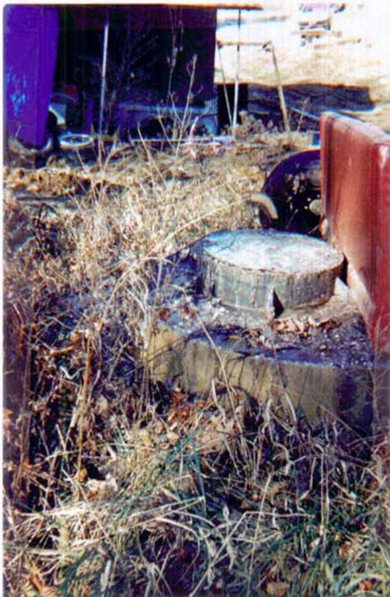
WARREN COUNTY WATER & SEWER – SHADY OAKS #1 MANHOLE WEST OF LIFT STATION - OVERFLOWING 1/15/02