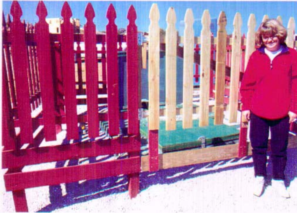
PUMP LIFT STATION IN INCLINE VILLAGE PICTURE 1