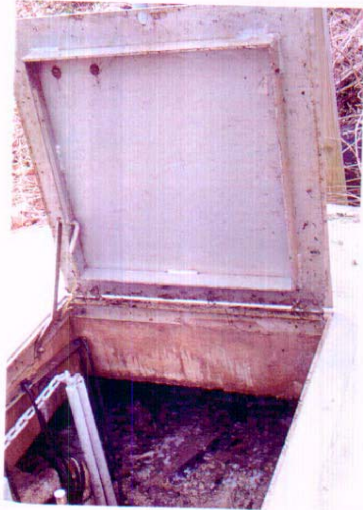
SHADY OAKS PUMP LIFT STATION PICTURE 4