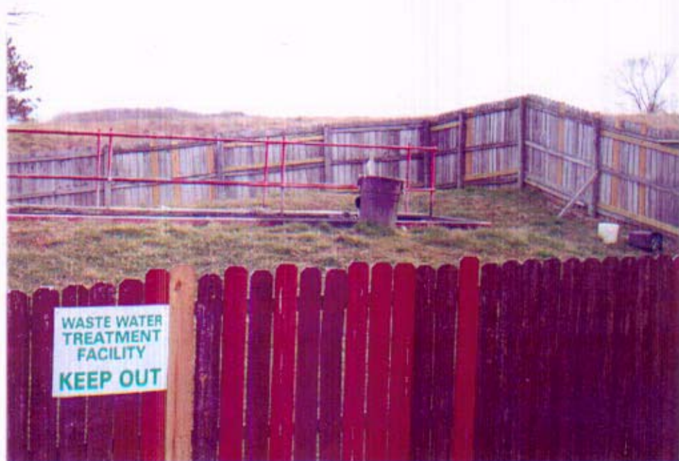
TREATMENT PLANT I NEAR GOLF COURSE PICTURE 2