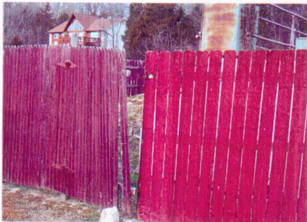
TREATMENT PLANT II NEAR LAKE PICTURE 1