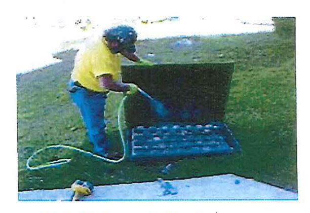
Ozarks Environmental Services 11 Oak Drive Kimberling City, MO 65686

To find out more about OES and how our services can assist you, contact us by calling: (417) 739-4100 or (417) 294-1963 or e-mail: clove@ozarksenvironmentalservices.org