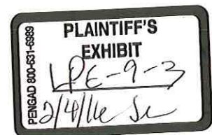
Exhibit No. 3 Date 2-4-16 Reporter JL File No. WR-2015-030