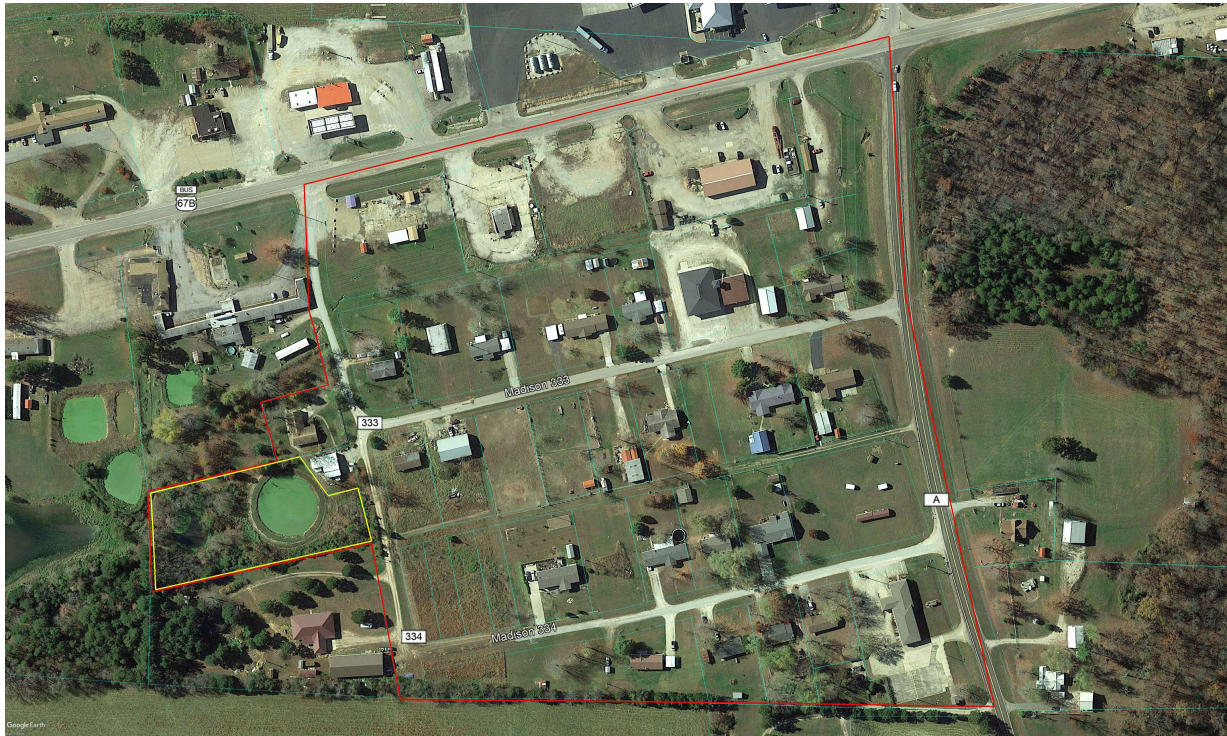
Map of DeGuire Subdivision Service Area

* Indicates new rate or text + Indicates change