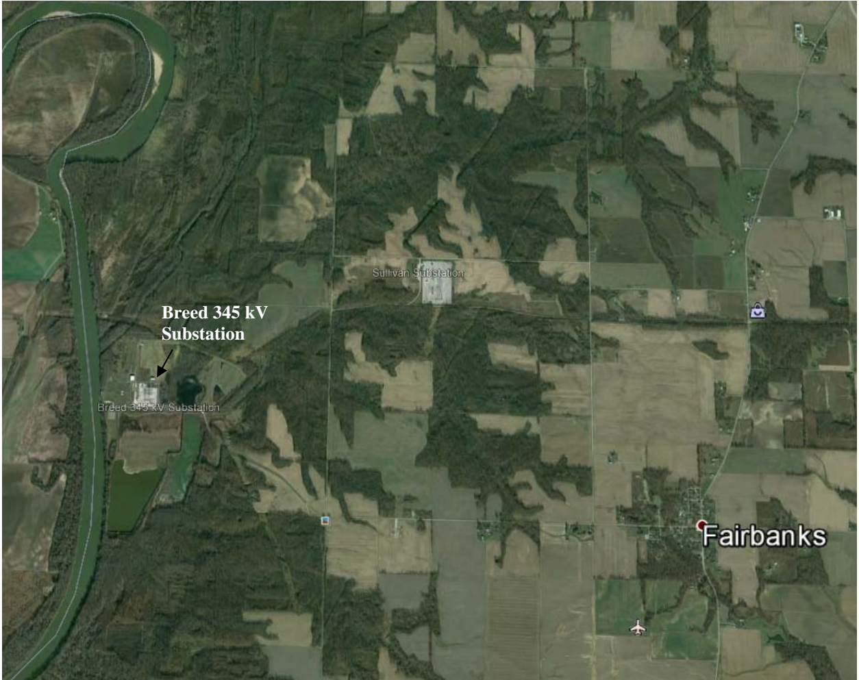
Figure 2 –Location of Breed 345 kV Substation near Fairbanks Indiana