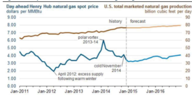
Figure 2 - Drop in Natural Gas Prices Following Strong Production Growth

Florida PSC found that lost opportunities are a reasonable trade-off to reduce exposure to cost increases that would result when prices ascend to higher levels