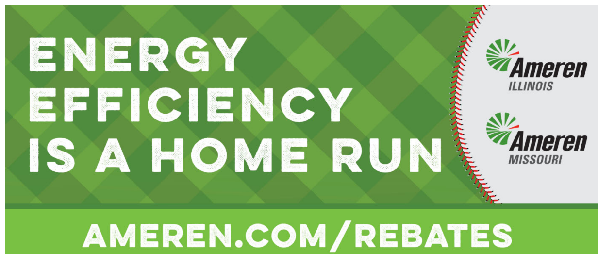
Figure 1 – Busch Stadium Signage

4. Prior Settlement. In its last Rider EEIC filing to adjust its EEIR, Ameren Missouri inadvertently omitted the $50,000 credit to customers negotiated in settlement of the prior MEEIA prudence review proceeding in File No. EO-2019-0376. Ameren Missouri will include the $50,000, plus interest, 5 in its next Rider EEIC filing to adjust its EEIR, as part of an "Ordered Adjustment" in the "Net Ordered Adjustment" component of its EEIR calculation