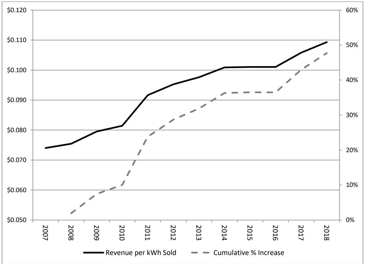
Figure 1. FERC Form 1 Reported TEB Revenue Per kWh Sold and Cumulative Percent Increase, 2007 - 2018. Source: Exhibit SWC-3