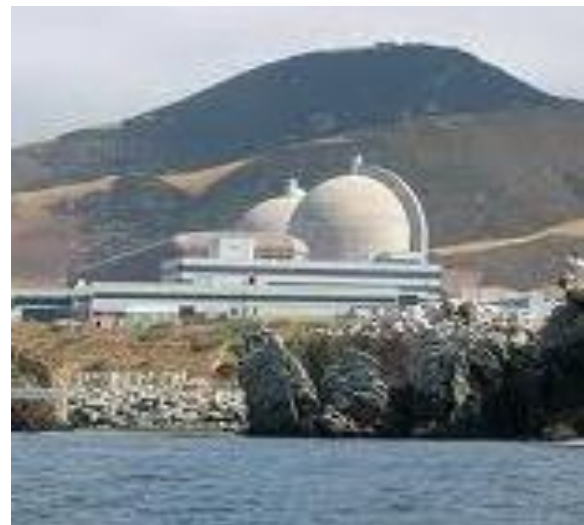
Diablo Canyon is designed to survive a 7.5 quake.

collaborate on building scenarios for USP, with a regional and possibly even a national focus. Collaboration by these organizations should produce a process that makes America’s most vitally important industry stronger and more resilient in decades to come. It is time to go beyond analysis that relies largely on extrapolation from current information and trends. It’s often said, “Nothing runs without electricity.” It’s time, in this far-reaching, most central industry, to construct a more robust basis for the essential service the industry provides.