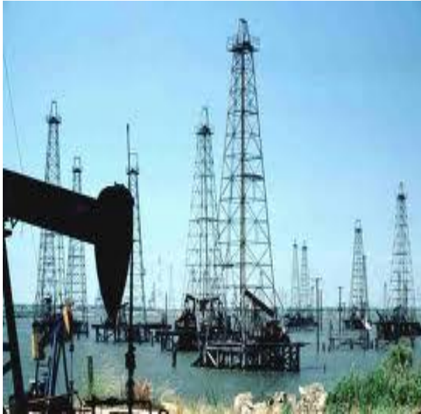
The coming of peak oil – a boon to EVs?

Scenario planning, as contemplated in this article, addresses circumstances that depart drastically from current trends. Some examples might be: regional political unrest drives curtailment of Mideast oil supplies driving market prices to $300 per barrel; or an unanticipated breakthrough in technology makes distributed generation more economic than new central station generation.