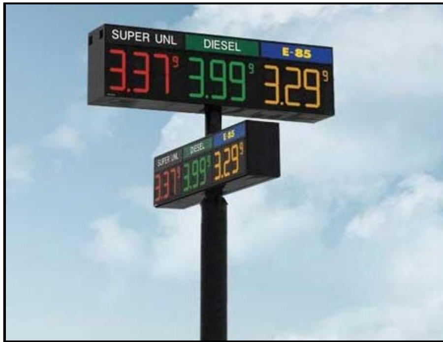
10 Figure 3: Example of Price-Competitive Marketing in the liquid-motor-fuels market

4 A. The current proposal lacks detail. As such, I cannot support the proposal. I am also skeptical 5 of expending a targeted budget of $1.6M on “education” when pricing electricity appropriately 6 and transparently should accomplish the task. Case in point, the liquid-motor-fuels market in 7 the U.S. is one of the most price-competitive markets in the world. As seen in Figure 3, prices 8 can be seen on big signs from a distance, and drivers aggressively go out of their way to seek 9 savings of just a few cents a gallon.