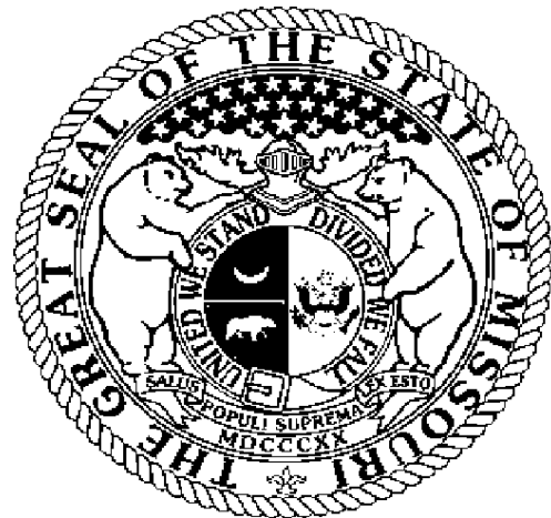
Secretary of State

Certification Number: 9625125-1 Reference: Verify this certificate online at http://www.sos.mo.gov/businessentity/verification