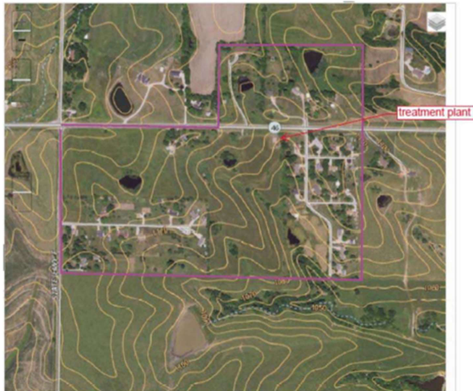
Country Side View