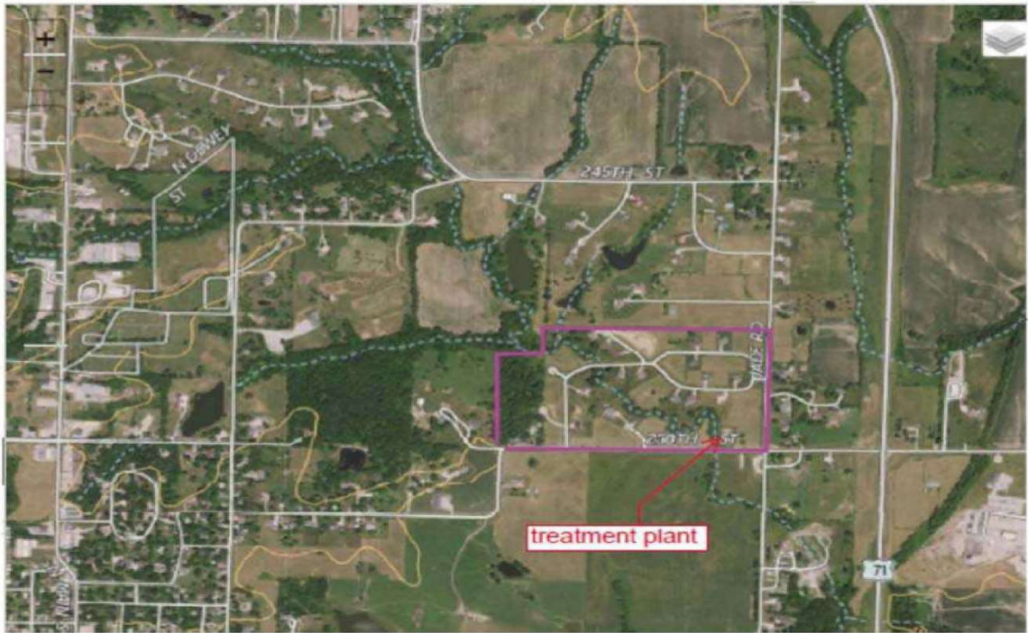
Scout Ridge Estates