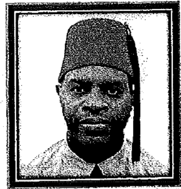
Private, Special and Priority Noble: Marquette: Lumumba: Mugabe Bey Washitaw Muur/Moor (Moorish-American) National

City: [REDACTED] State: [REDACTED] Non-Domestic Non-Federal zone [Washitaw de Dugdyahmoundyah] [REDACTED]