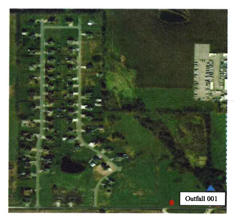
Attachment #2 - Aerial Image Clinton Estates Page 1 of 2