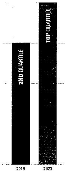
As measured by Ameren Missouri and Ameren Illinois' System Average Interruption Frequency Index (SAIFI) data.