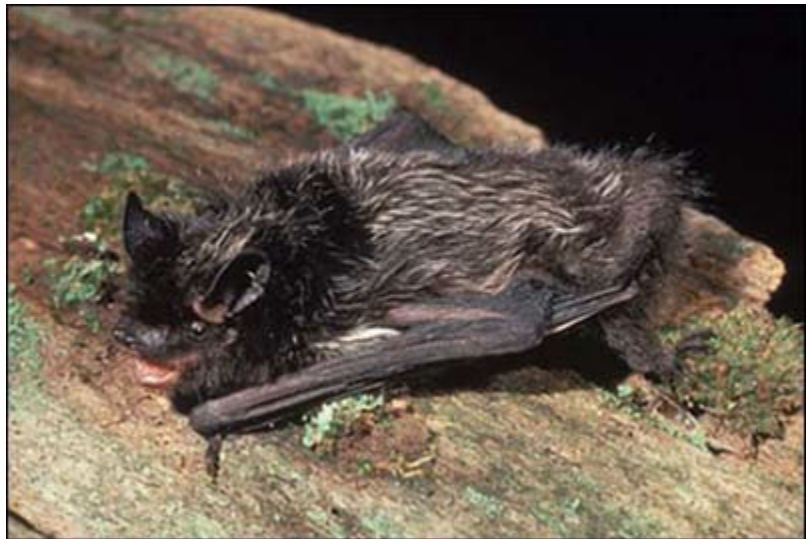
Migratory tree-roosting bats including hoary bats, eastern red bats, and silver-haired bats (shown above) make up a large proportion of the bats killed by wind turbines but are not protected under Federal law.

Studies of bat fatalities have shown that turbines have been consistently associated with fatalities of some species of bats in many different areas of the continent. Specifically, migratory tree-roosting bats including hoary bats ( Lasiurus cinereus ), eastern red bats ( L. borealis ), and silver-haired bats ( Lasionycteris noctivagans ) make up a large proportion of the bats killed. These species are not protected by