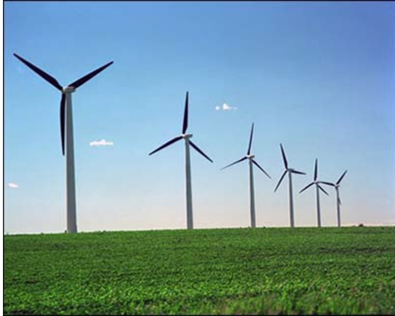
Some of the Indiana bat fatalities occurred at wind facilities located in open agricultural areas. The bats were likely migrating from summer to winter areas.