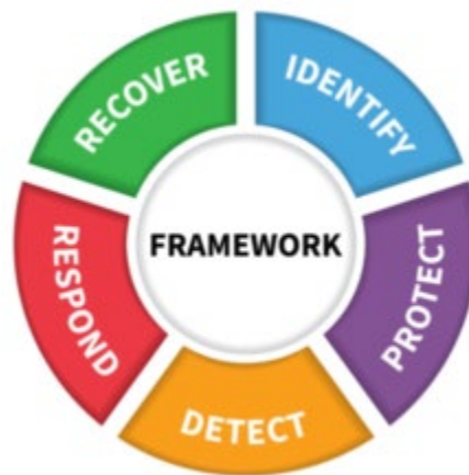
10 Figure 2. NIST’s Cybersecurity Framework

11 12 Q. Briefly describe these five functions.