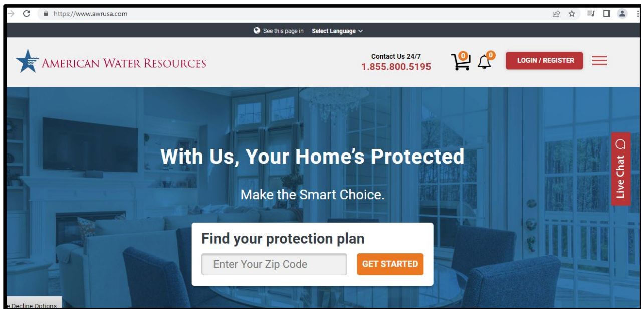
9 Figure 2: American Water Resources Home Protection Program 5

4 A. Many. American Water’s historic ability to enter into, maintain, and profit from more than 5 $1.25 billion in revenue from the sale of its Homeowner Services Group despite a “competitive 6 market” was predicated on its unique monopolistic control of captive customers through its 7 regulated water and sewer services as well as, through the use of its unique customer facing 8 branding. This branding continues today as seen in Figure 2: