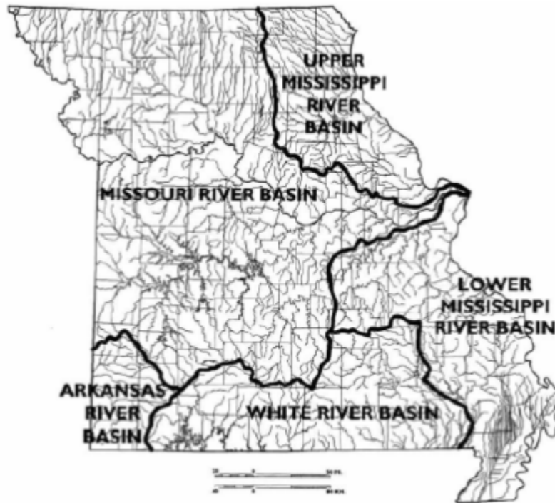
1 Figure 2: Major drainage basins in Missouri 10

2 3 Surface water is generally more expensive to treat than ground water. While both sources 4 are dependent on fluctuations in the weather, surface water availability will be impacted 5 more rapidly during both droughts and heavy rain seasons. Ultimately, the interdependence 6 of the ecosystem is such that any major development in either source will impact the 7 quantity and quality of the other. 11