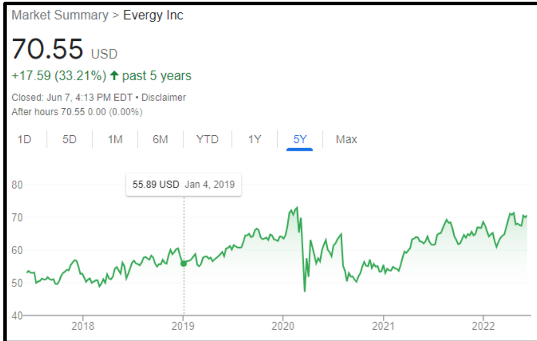
1 Figure 1: EVRG Ticker 6/7/2022

3 Q. Those are great outcomes for shareholders. How have ratepayers fared?