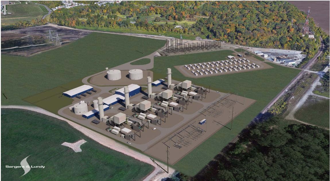
Figure 3: Castle Bluff BESS Project adjacent to CTG's (for illustrative purposes and subject to change)

2 Q. You also mentioned the Huck Finn Solar Energy Center. How are the 3 Huck Finn Solar Energy Center and the Huck Finn BESS Project related?