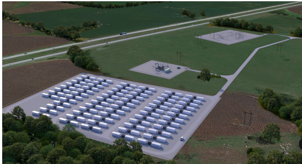
6 Figure 2: Millcreek BESS Project (for illustrative purposes and subject to change)

1 preserves system reliability while offering flexibility and timely market access for 2 resources that meet defined technical constraints. The ERAS study process has been 3 completed, and the associated expedited generator interconnection agreement has been 4 executed for the Millcreek BESS project. See Figure 2 for a preliminary rendering of the 5 Millcreek BESS Project Site.