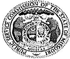
Exhibit No.: 0 Issue: Accounting Schedules Witness: MO PSC Auditors Sponsoring Party: MO PSC Staff Case No: WR-2017-0285 Date Prepared: November 30, 2017