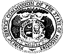
Exhibit No.: 0 Issue: Accounting Schedules Witness: MO PSC Auditors Sponsoring Party: MO PSC Staff Case No: WR-2017-0285 Date Prepared: November 30, 2017