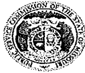
Exhibit No.: Issue: Accounting Schedules Witness: MO PSC Auditors Sponsoring Party: MO PSC Staff Case No: WR-2017-0285 Date Prepared: 11/30/2017