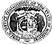
Exhibit No.: Issue: Accounting Schedules Witness: MO PSC Auditors Sponsoring Party: MO PSC Staff Case No: WR-2017-0285 Date Prepared: 11/30/2017