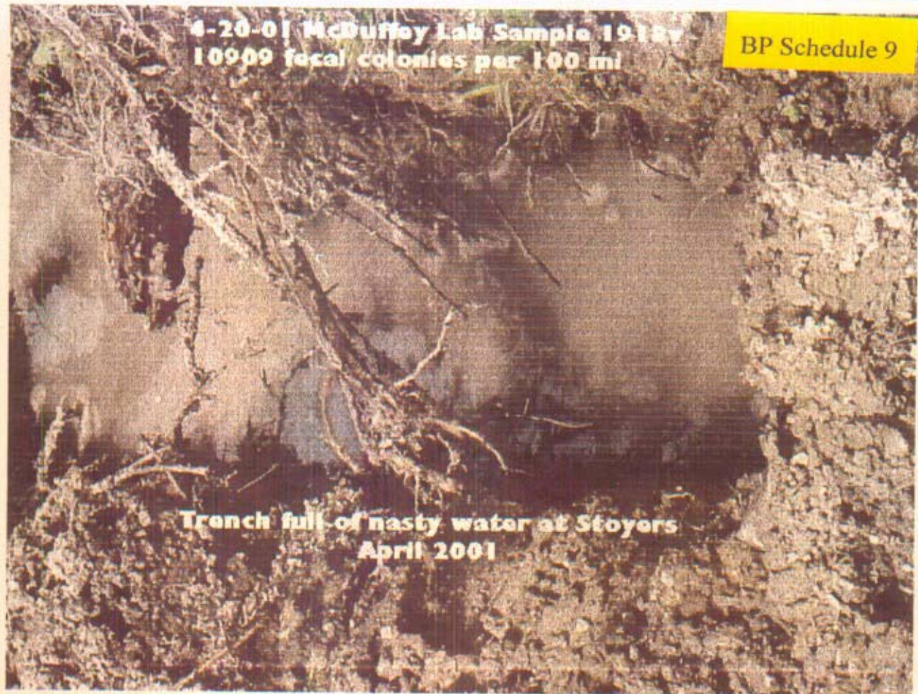
Trench full of nasty water at Stoyers April 2001